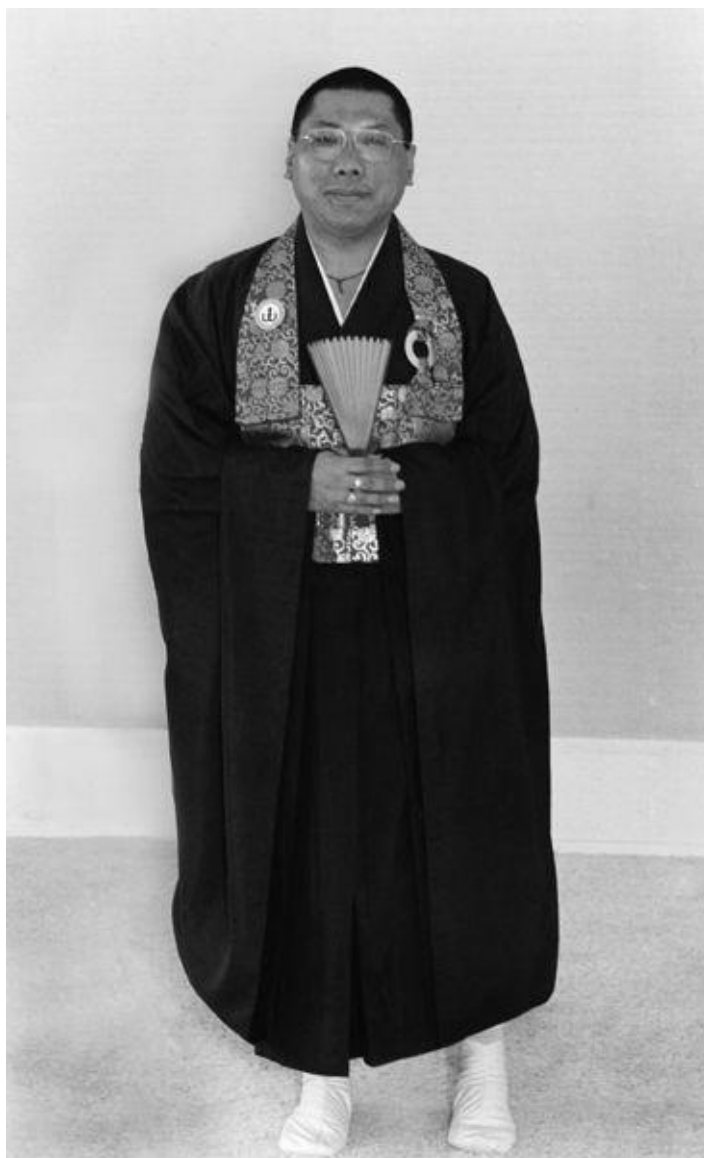
Photo 1. Chögyam Trungpa Rinpoche in simple Zen teaching robes.

When we meet the spiritual friend, we realize that we ourselves can give birth to both absolute and relative bodhichitta by our own effort, but we cannot do this without their example. By means of the spiritual friend's example, we can actually take a step forward—and the first step we take is to develop kindness to ourselves.