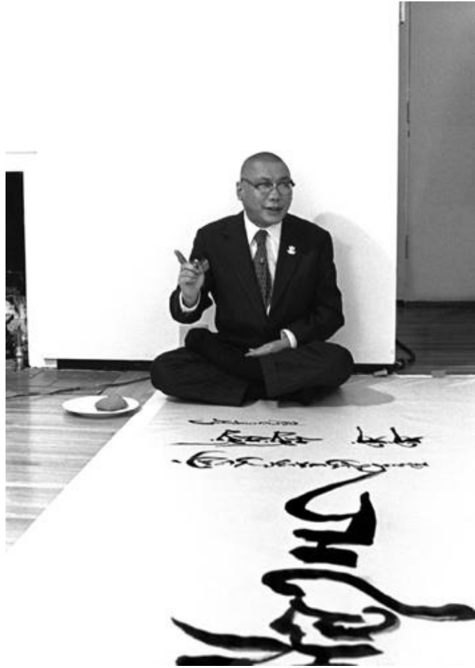
Photo 3. Chögyam Trungpa next to one of his brush calligraphies, an art form that combines into a single gesture emptiness, compassion, and awareness.

There is something very empty about the whole thing. It is actually very hollow, full of all kinds of hoaxes. We think very cleverly; we even think up all kinds of philosophical terms, beyond bread-and-butter language. We think of all kinds of fantastic words, which we call our beliefs: “I believe in the blah-blah. I believe in this. I don’t believe in that.” But what do we really mean by those things? Do we really know the language completely? And what is language, anyway? Sometimes we get panicky about that. We decide to call language something deeper, such as a mantra, or an utterance that comes from above us. But then again, what do we mean by “above us”? What do we mean by “deeper”? The hollowness still goes on; it goes on all the time. Whatever we do, whatever we say, there is always something fishy happening. Something really