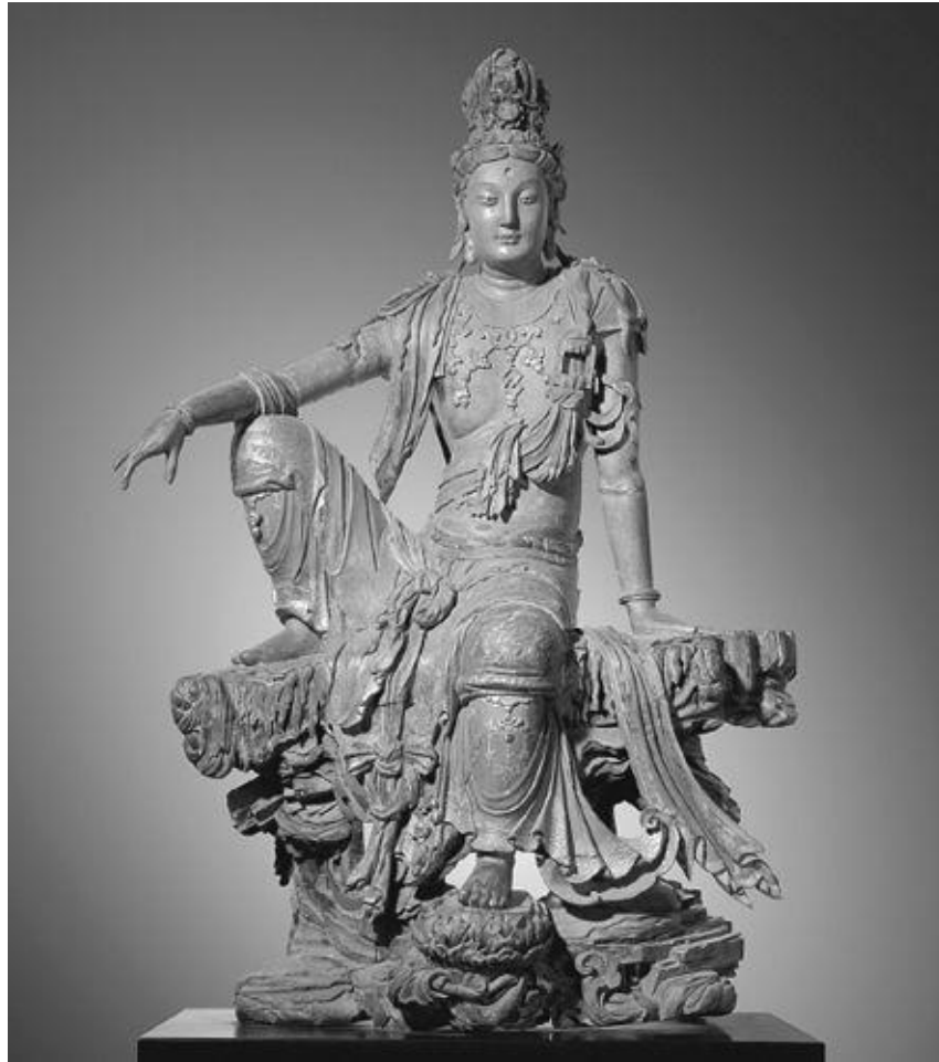
Photo 2. The bodhisattva Guanyin (above) is the embodiment of compassion in feminine form. Compassion in masculine form is represented by the bodhisattva Avalokiteshvara. Nelson-Atkins Museum of Art.

In the mahayana, the egoless aspect of loneliness continues in the realization of the nonexistence of your self. But you have to give up the possible excitement of watching yourself attaining enlightenment. You have to go away, to disappear. The ego part has to disappear, and the reference point does not exist. So it is kind of a sweet-and-sour promise and experience. Loneliness becomes heroism because you are fighting this particular war all by yourself. You are not relying on anybody's help to work with sentient beings or to work with yourself. The spiritual friend is just an adviser who tells you how lonely you are, and how such an individual fight is necessary. So you do not get any personal help, and nobody is going to be a copilot on your journey. Nevertheless, there is still a quality of delight, and there is a feeling of comradeship with other people who are doing