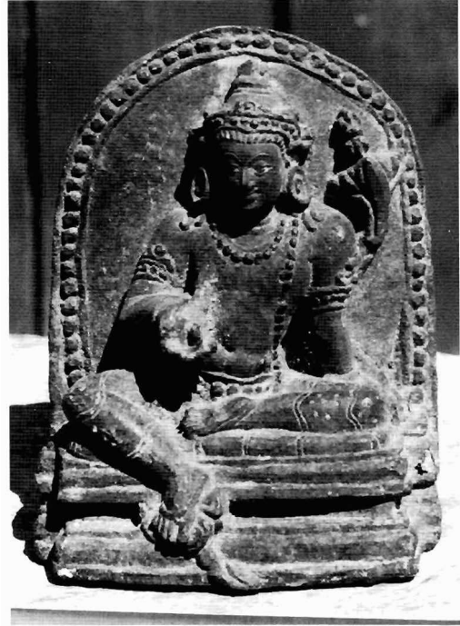
Fig. 10. Vajrapāṇi, inscribed, from Nalanda Museum (no. 00016), stone, 12 cm high, 9th century.