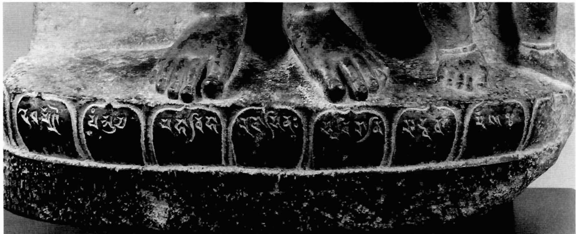
Fig. 5. Ditto, donative inscription on the pedestal in the Siddhamātrkā script of early 8th century.