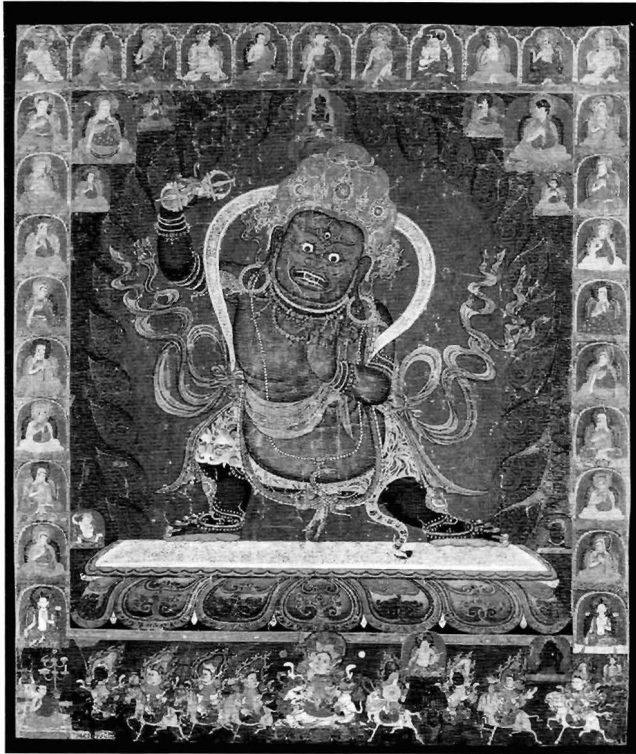
Fig. 20. Caṇḍa-Vajrapāṇi, painting on cloth, from Central Tibet, 115×95 cm, early 15th century.