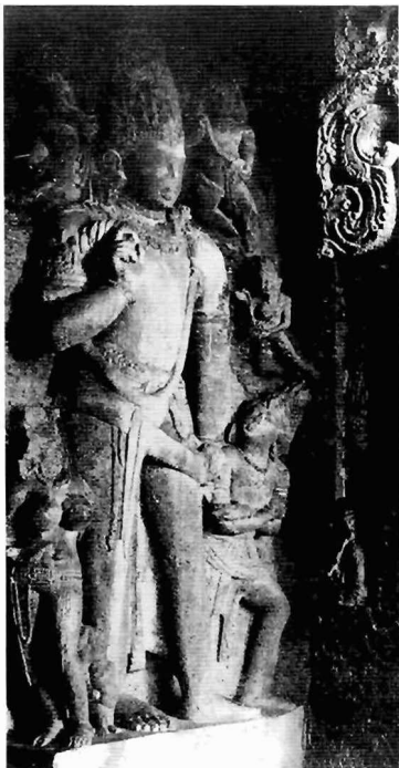
Fig. 8. Dvārapāla from the right entrance of Cave 6 at Ellora. Maitreya?, 7th century. Partial reproduction from Zimmer, pl. 192.