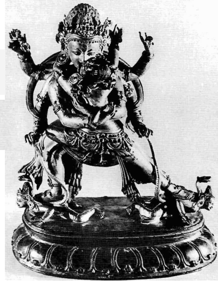
Fig. 17. Vajrapāṇi, six-armed, embracing Śabdavajrā (Mahācakra-Vajrapāṇi), gilt bronze with polychrome, inlaid with semiprecious stones, from Nepal, now Los Angeles Country Museum of Art, 13-1/4 in. high, 15th century.