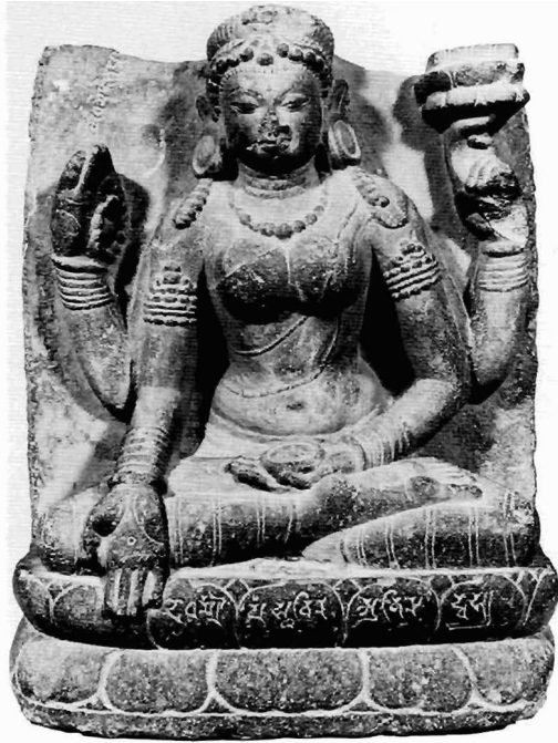
Fig. 6. Cundā, inscribed, stone, from Bodhgaya, now National Museum, New Delhi, early 8th century.