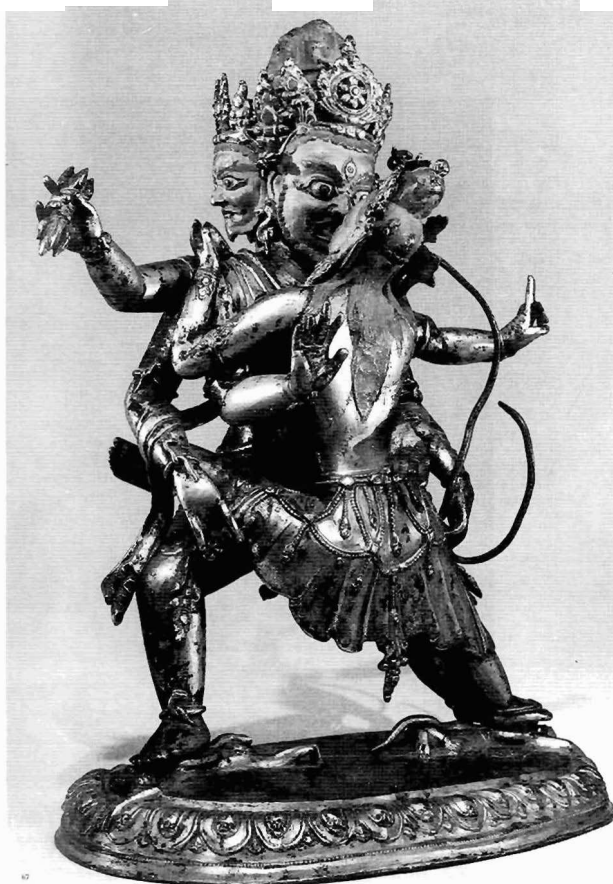
Fig. 21. Vajrapāṇi, three-headed, six-armed, embracing Śabdavajrā (Mahācakra-Vajrapāṇi), brass with cold gold paste and pigments, from Central Tibet, now Zimmerman Collection. 37.6 cm high, 15th century.