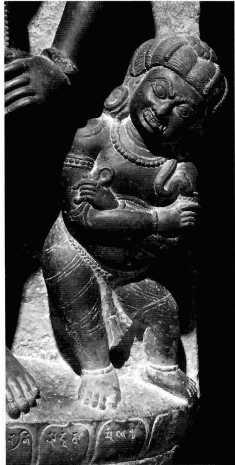
Fig. 4. Ditto, attendant figure.