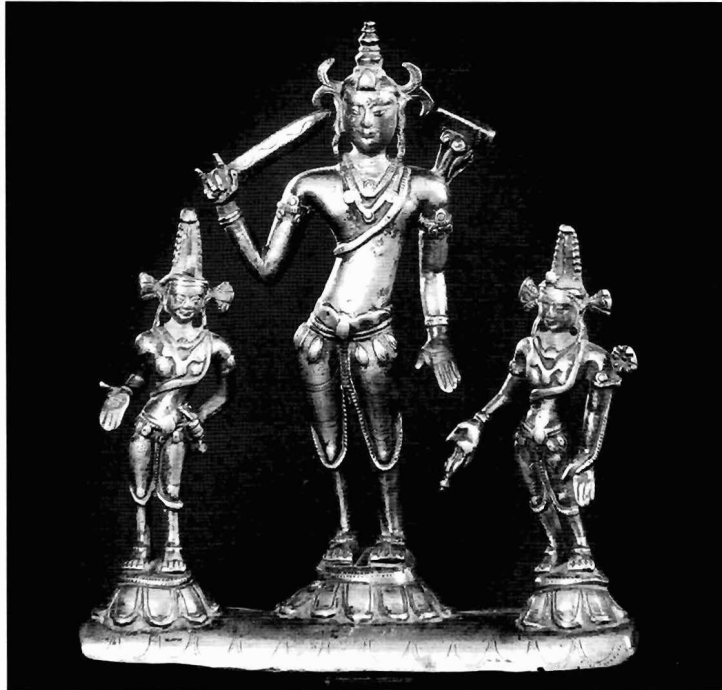
Fig. 13. Vajrapāṇi, Mañjuśrī and Padmapāṇi (Avalokiteśvara), bronze, perhaps from Ladakh, now Neustatter Collection, Los Angeles. 18 cm high, c. 12th century.