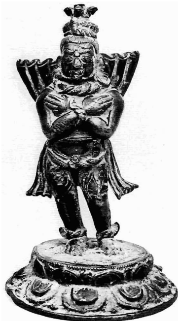
Fig. 14. Vajrapuruṣa?, gilt copper, from Nepal, now Los Angeles Museum of Art, 5-1/4 in. high, 10th century, Courtesy Los Angeles County Museum of Art.