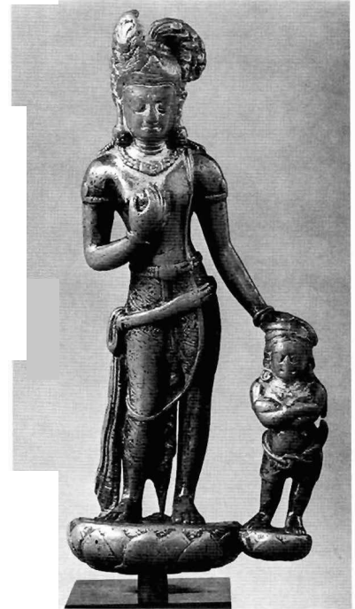
Fig. 7. Vajrapāṇi with Vajrapuruṣa, copper with traces of gold from Nepal. 17.8 cm high, 8th century.