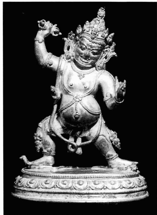
Fig. 19. Caṇḍa-Vajrapāṇi, gilt bronze, from Tibet, 16 cm high, 16th century.