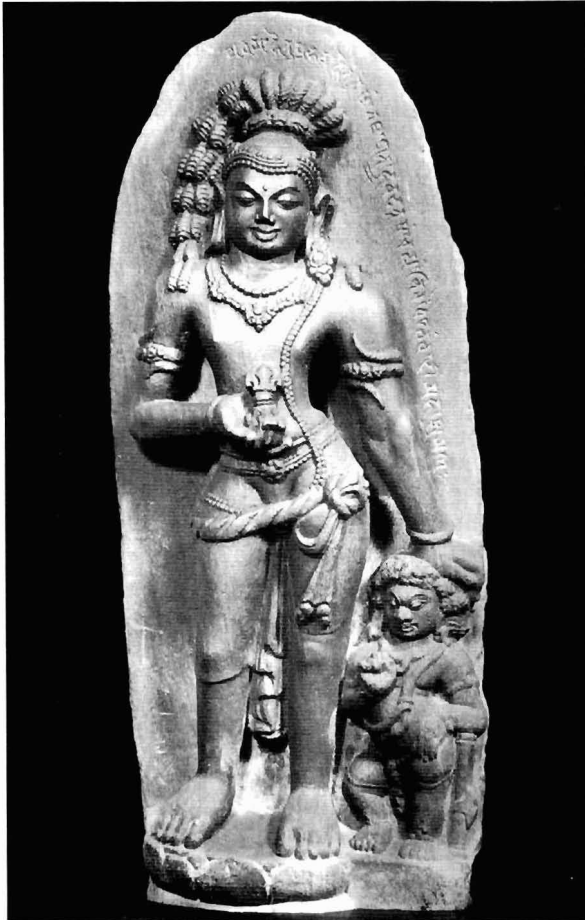
Fig. 1. Vajrapāṇi with attendant, inscribed, stone, from Nalanda.

Irving Collectern, now Metropolitan Museum of Art, New York, 30 inches high, 7th century.