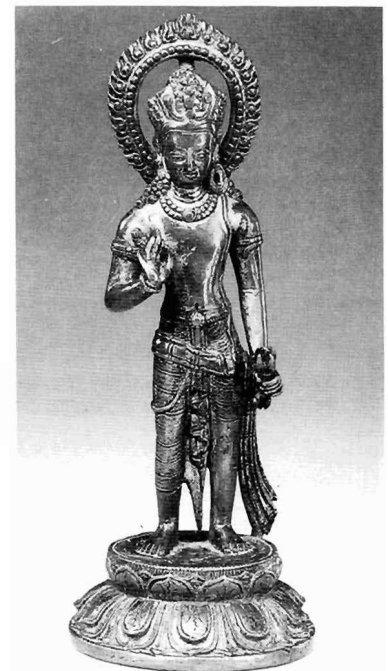
Fig. 15. Vajrapāṇi, bronze, from Nepal, 24.8 cm high, c. 10th century