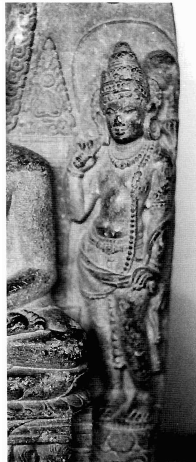
Fig. 12. Ditto, Vajrapāṇi.