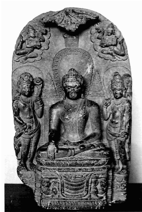
Fig. 11. Buddha with Vajrapāṇi and Avalokiteśvara, inscribed, from South Bihar, now Patna Museum (Sohoni Collection), stone, 9th-10th century.