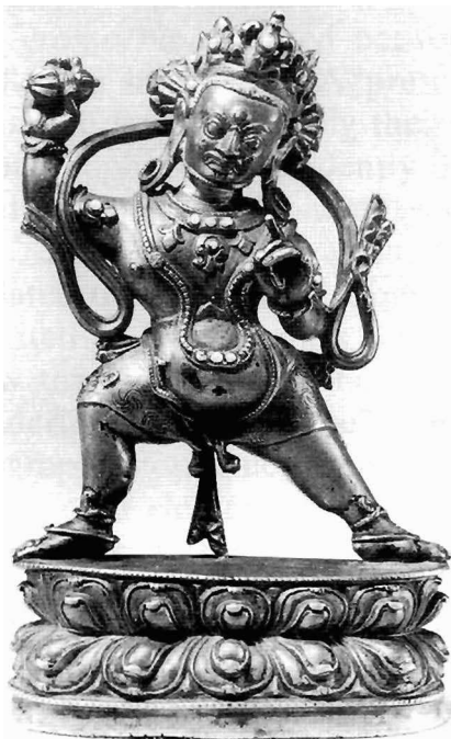
Fig. 18. Caṇḍa-Vajrapāṇi, gilt bronze, from Western Tibet, 18.4 cm high, 15/16 century.