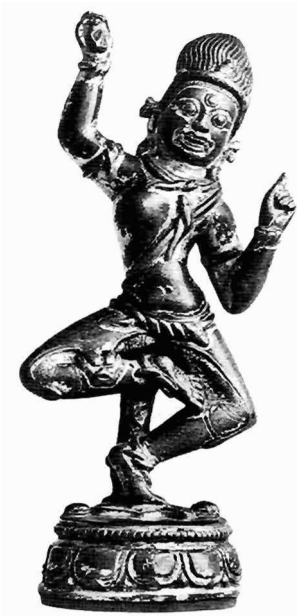
Fig. 16. Vajrapāṇi, gilt copper, from Nepal, now Los Angeles Country Museum of Art, 21.3 cm high, 9th-10th century.