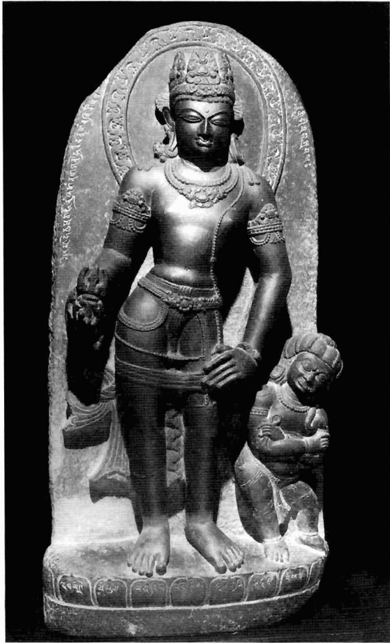
Fig. 3. Vajrapāṇi with attendant, inscribed, stone, possibly from Bodhgaya. David Young Collection, New York, 33 inches high, early 8th century.