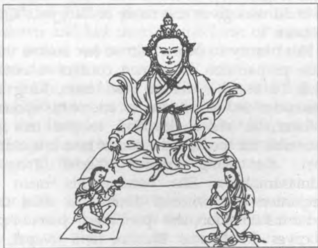
Songtsen Gampo and his two spouses

THE TWO SPOUSES OF SONGTSEN GAMPO — From the very beginning of the introduction of buddhism in Tibet, women have played an important role. King Songtsen Gampo, who reigned at the time buddhism was implanted in the Land of Snow, had two spouses. Their profound faith and realization were so impressive that these women are sometimes considered as emanations of Tara.