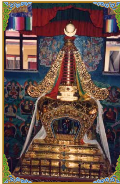
供奉敦珠法王二世法體之「舍利塔」 The Stupa in Which H.H. Dudjom Rinpoche's Kudung was Being Enshrined (1989)