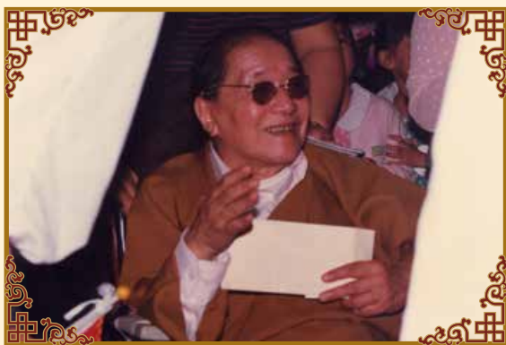
敦珠法王二世攝於台灣國際機場(1984) H.H. Dudjom Rinpoche was Arriving at the Taiwan International Airport (1984)