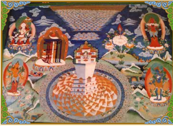
位於尼泊爾祖廟內之壁畫 The Wall Paintings at the Kudung Gopa of H.H. Dudjom Rinpoche (1989)