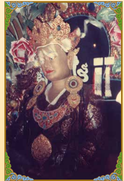
位於尼泊爾祖廟內之藏王赤松德贊像 A Buddhist Statue at the Kudung Gopa of H.H. Dudjom Rinpoche (1989)