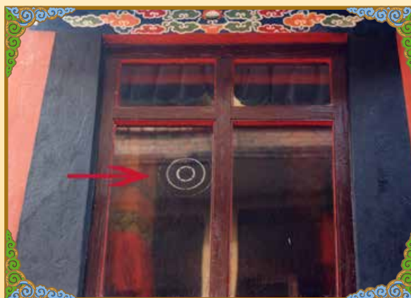
舉行敦珠法王二世法體「奉安晉塔」儀式時，出現在祖廟內窗上之虹光明點 Thigles Appeared on the Window Panes During the Enshrinement Ceremony at the Kudung Gompa of H.H. Dudjom Rinpoche (1989)