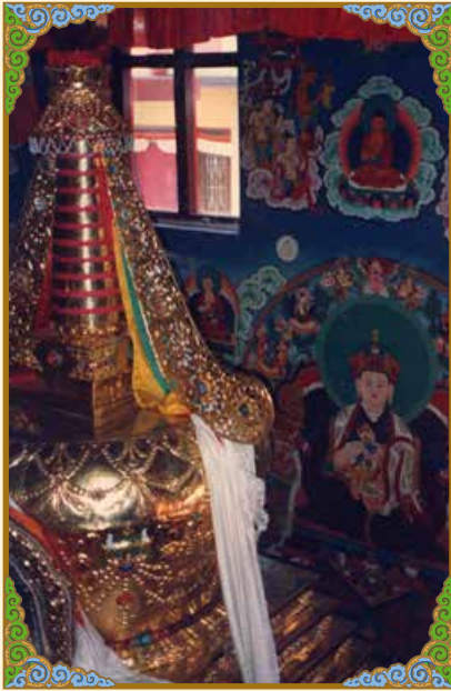
供奉敦珠法王二世法體之「舍利塔」 The Stupa in Which H.H. Dudjom Rinpoche's Kudung was Being Enshrined (1989)