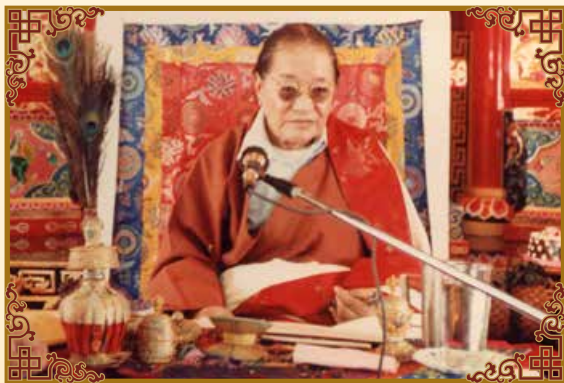
敦珠法王二世於台灣台中市主持佛像開光法會(1984) H.H. Dudjom Rinpoche was Consecrating the Buddhist Statues in Taichung, Taiwan (1984)