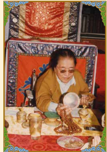
敦珠法王二世於灌頂法會時攝(1984) H.H. Dudjom Rinpoche was Giving Initiations (1984)