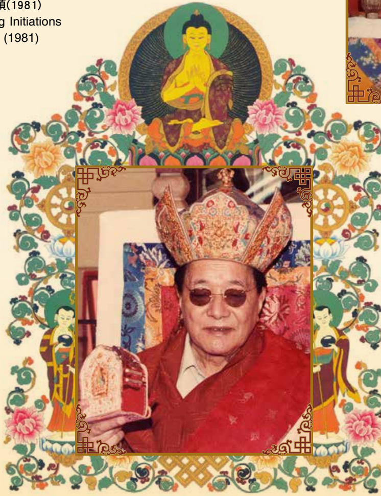
敦珠法王二世於灌頂法會時攝(1981) H.H. Dudjom Rinpoche was Giving Initiations (1981)