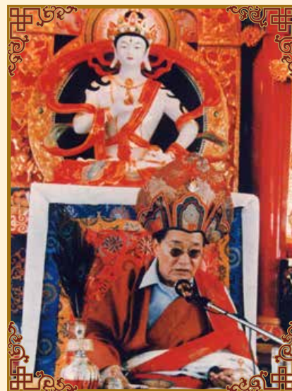
敦珠法王二世於台灣台中市主持佛像開光法會(1984) H.H. Dudjom Rinpoche was Consecrating the Buddhist Statues in Taichung, Taiwan (1984)