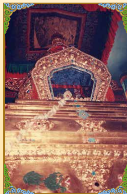
供奉敦珠法王二世法體之「舍利塔」 The Stupa in Which H.H. Dudjom Rinpoche's Kudung was Being Enshrined (1989)

廟內之「舍利塔」及所有壁畫全部均由夏札(威操)法王設計及統籌。 All the Wall Paintings and The Stupa Within the Temple were Designed and Coordinated by H.H. Chadral Sangye Dorje Rinpoche.