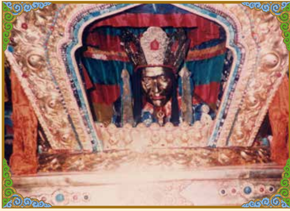
敦珠法王二世法體於「舍利塔」內之近鏡 A Close-Up of the Stupa in Which H.H. Dudjom Rinpoche's Kudung was Being Enshrined (1989)