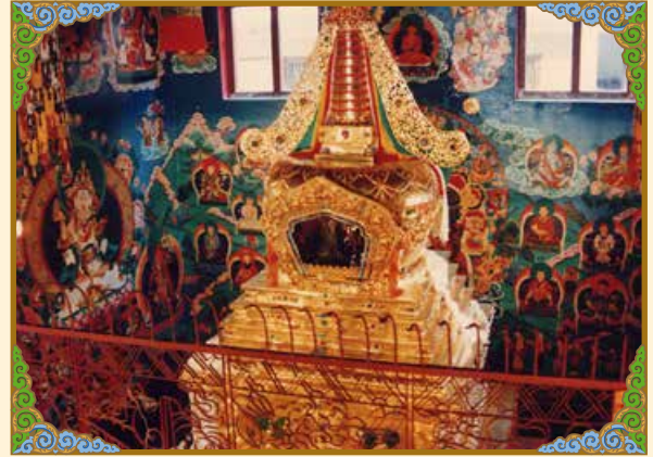
供奉敦珠法王二世法體之「舍利塔」 The Stupa in Which H.H. Dudjom Rinpoche's Kudung was Being Enshrined (1989)