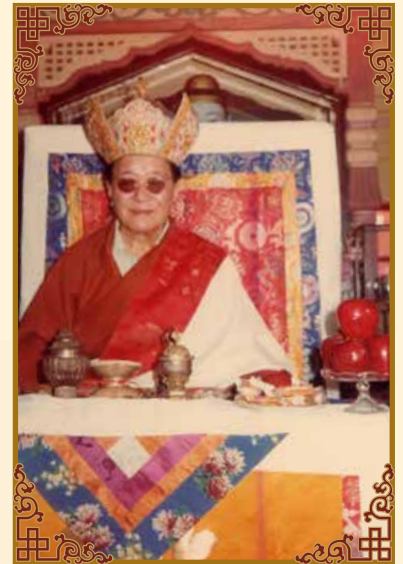
敦珠法王二世攝於灌頂法 會(1981) H.H. Dudjom Rinpoche was Giving Initiations (1981)