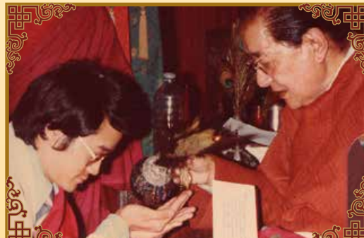
敦珠法王二世為移喜泰賢灌頂(1981) Yeshe Thaye was Receiving Initiations from H.H. Dudjom Rinpoche (1981)