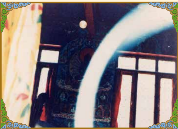
舉行敦珠法王二世法體「奉安晉塔」儀式時，出現在祖廟內之虹光 Rainbows Appeared During the Enshrinement Ceremony at the Kudung Gompa of H.H. Dudjom Rinpoche (1989)