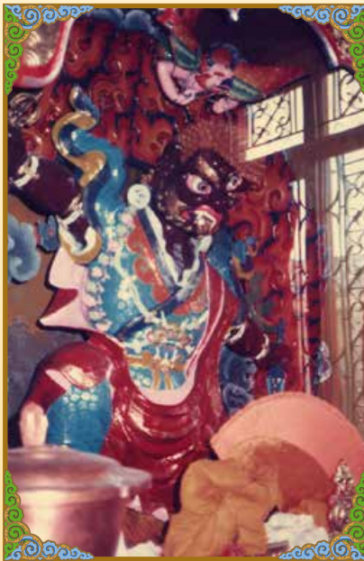
位於尼泊爾祖廟內之忿怒蓮師像 A Buddhist Statue at the Kudung Gopa of H.H. Dudjom Rinpoche (1989)