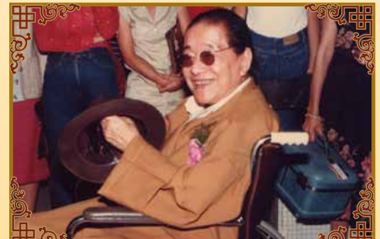
敦珠法王二世 (1981) H.H. Dudjom Rinpoche (1981)