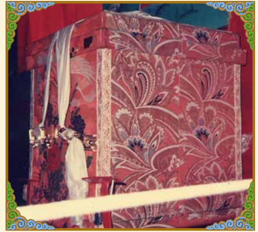
敦珠法王二世之法體由法國運返尼泊爾時所專用之寶箱 The Holy Casket, in Which H.H. Dudjom Rinpoche's Kudung was Contained, was Transferred from France Back to Nepal (1989)