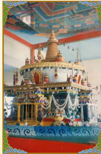
供奉於尼泊爾祖廟內之立體壇城 The 3-D Mandala at the Kudung Gopa of H.H. Dudjom Rinpoche (1989)