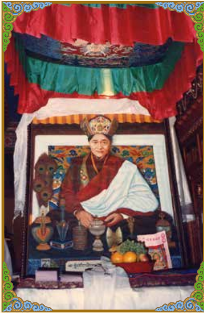
供奉於尼泊爾祖廟內之 敦珠法王二世法相 The Holy Picture of H.H. Dudjom Rinpoche That was Placed at the Kudung Gompa of H.H. Dud- jom Rinpoche During the Enshrinement Ceremo- ny (1989)