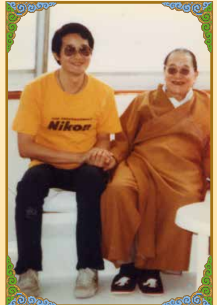
敦珠法王二世與移喜泰賢 (1984) H.H. Dudjom Rinpoche and Yeshe Thaye (1984)