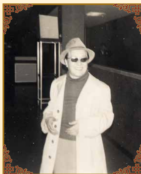
敦珠法王二世離港時攝於香港啟德機場 (1972) H.H. Dudjom Rinpoche Leaving Hong Kong at the Hong Kong International Airport (1972)