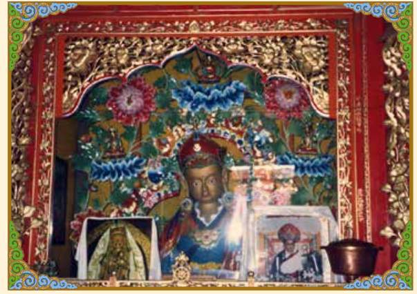
位於尼泊爾祖廟內之蓮師像 A Buddhist Statue at the Kudung Gopa of H.H. Dudjom Rinpoche (1989)