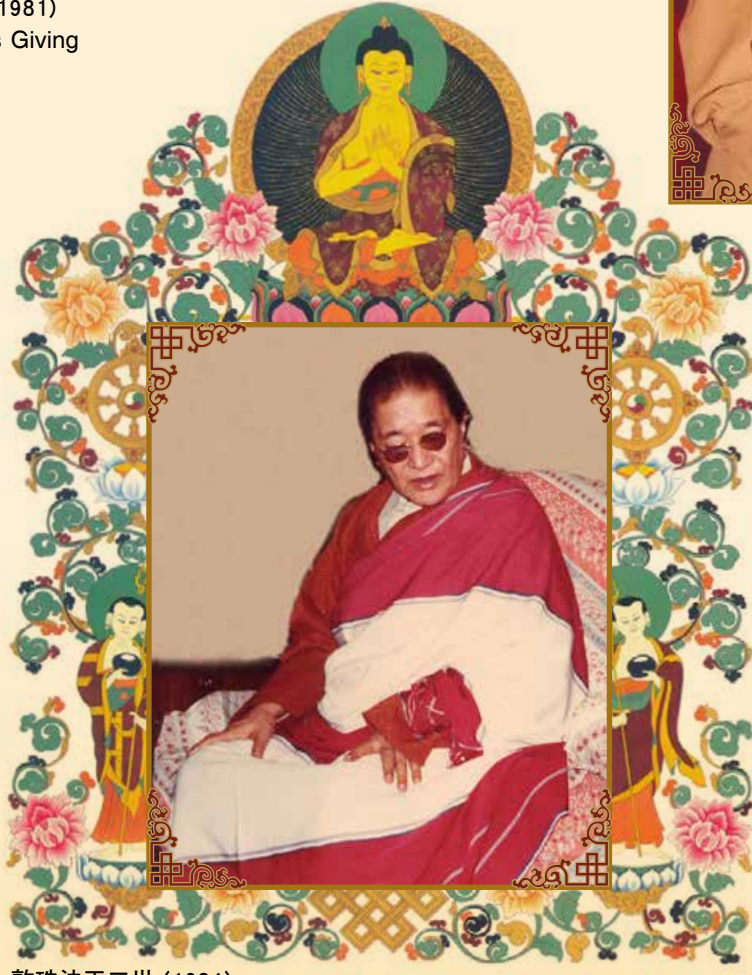
敦珠法王二世 (1981) H.H. Dudjom Rinpoche (1981)