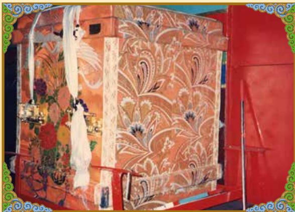
敦珠法王二世之法體由法國運返尼泊爾時所專用之寶箱 The Holy Casket, in Which H.H. Dudjom Rinpoche's Kudung was Contained, was Transferred from France Back to Nepal (1989)