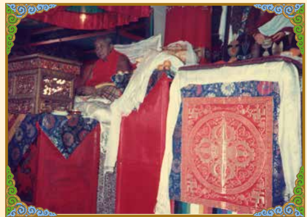
頂果法王主持敦珠法王二世法體「奉安晉塔」儀式 H.H. Dilgo Khenytse Rinpoche was Presiding at the Enshrinement Ceremony at the Kudung Gompa of H.H. Dudjom Rinpoche (1989)