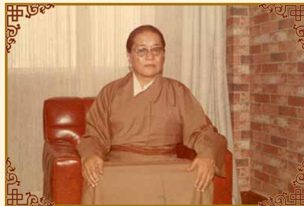
敦珠法王二世攝於香港(1972) H.H. Dudjom Rinpoche in Hong Kong (1972)