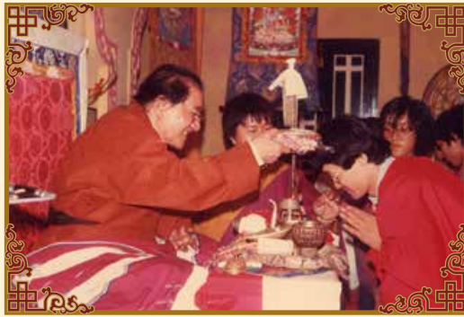
敦珠法王二世為移喜泰賢灌頂(1981) Yeshe Thaye was Receiving Initiations from H.H. Dudjom Rinpoche (1981)