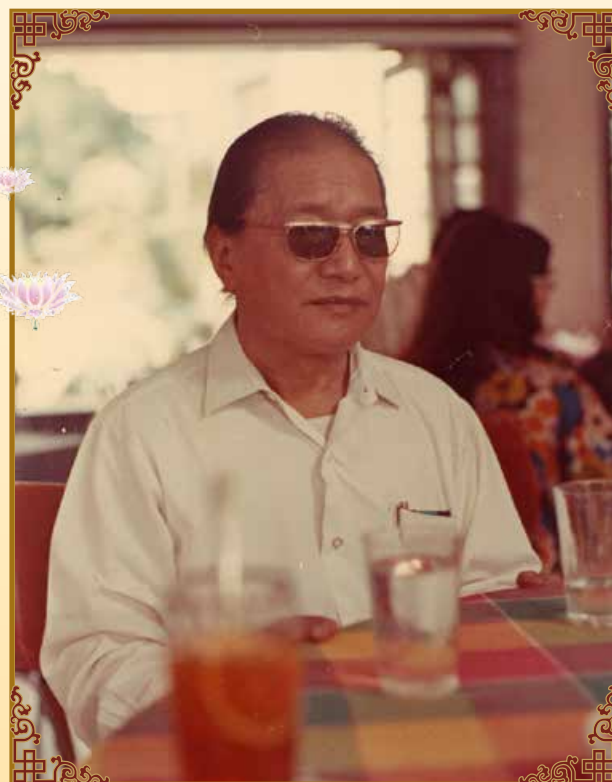
敦珠法王二世攝於香港(1972) H.H. Dudjom Rinpoche in Hong Kong (1972)