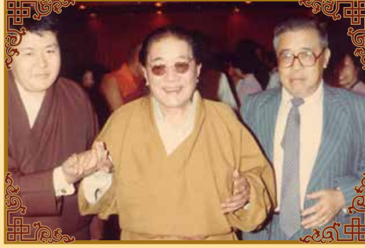
敦珠法王二世、劉銳之金剛上師與仙瀧仁波切 (1981) H.H. Dudjom Rinpoche, with Ven. Guru Lau and Ven. Shenphen Rinpoche (1981)