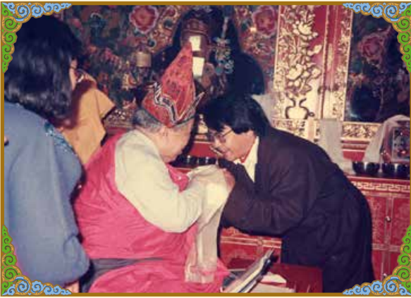
索甲仁波切於祖廟內向劉銳之金剛上師獻上「哈達」 Ven. Sogyal Rinpoche was Offering Khada to Ven. Guru Lau During the Break of the Ceremony (1989)