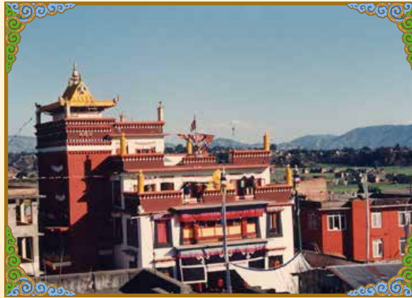
位於尼泊爾之敦珠法王二世祖廟全境 The Whole Scene of the Kudung Gumpa of H.H. Dudjom Rinpoche (1989)