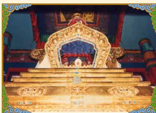
供奉敦珠法王二世法體之「舍利塔」 The Stupa in Which H.H. Dudjom Rinpoche's Kudung was Being Enshrined (1989)