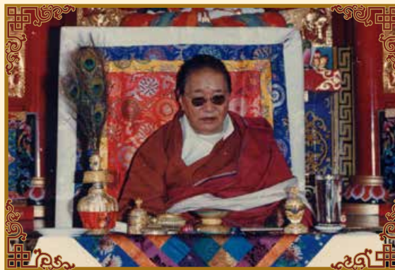
敦珠法王二世於台灣台中市主持佛像開光法會(1984) H.H. Dudjom Rinpoche was Consecrating the Buddhist Statues in Taichung, Taiwan (1984)