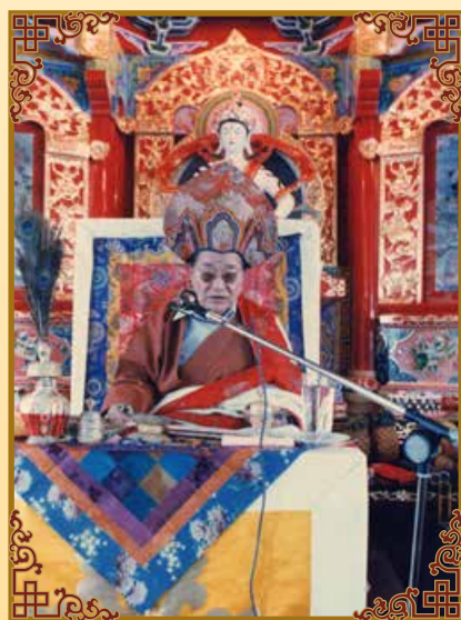
敦珠法王二世於台灣台中市主持佛像開光法會(1984) H.H. Dudjom Rinpoche was Consecrating the Buddhist Statues in Taichung, Taiwan (1984)