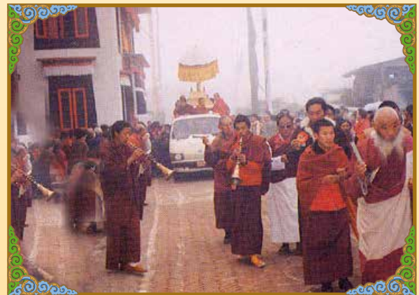
依怙主 夏札(威操)法王迎接敦珠法王二世之法體回歸尼泊爾之祖廟(1989) H.H. Chadral Sangye Dorje Rinpoche Led All the Disciples of H.H. Dudjom Rinpoche in Receiving His Holiness' Kudung at the Kudung Gumpa (1989)