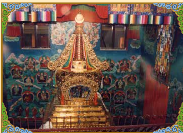
供奉敦珠法王二世法體之「舍利塔」 The Stupa in Which H.H. Dudjom Rinpoche's Kudung was Being Enshrined (1989)