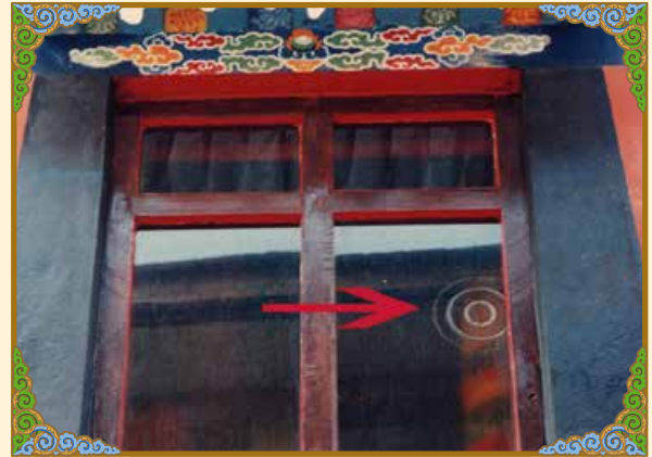
舉行敦珠法王二世法體「奉安晉塔」儀式時，出現在祖廟內窗上之虹光明點 Thigles Appeared on the Window Panes During the Enshrinement Ceremony at the Kudung Gompa of H.H. Dudjom Rinpoche (1989)