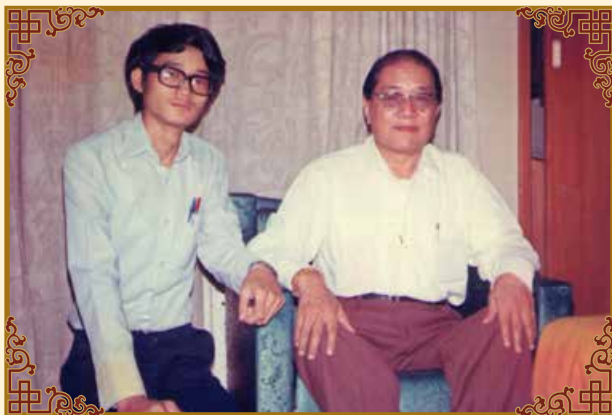
敦珠法王二世與移喜泰賢(1972) H.H. Dudjom Rinpoche and Yeshe Thaye (1972)