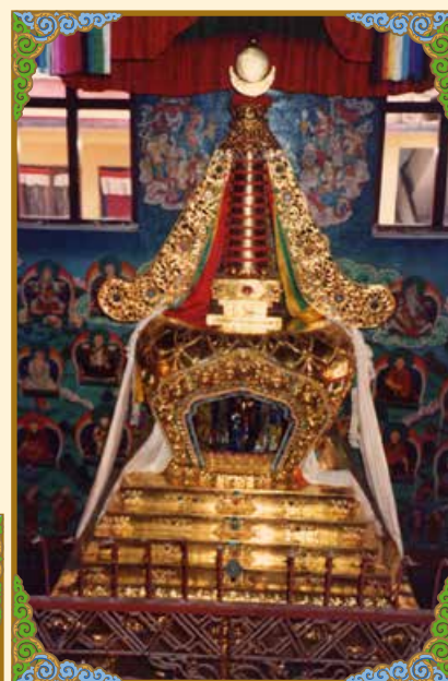
供奉敦珠法王二世法體之「舍利塔」 The Stupa in Which H.H. Dudjom Rinpoche's Kudung was Being Enshrined (1989)

The Stupa in Which H.H. Dudjom Rinpoche's Kudung was Being Enshrined (1989)