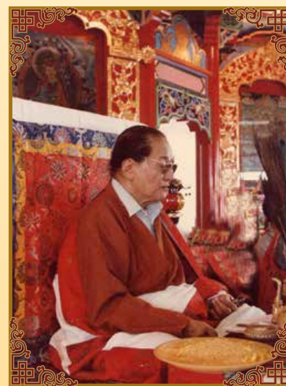
敦珠法王二世於台灣台中市主持佛像開光法會(1984) H.H. Dudjom Rinpoche was Consecrating the Buddhist Statues in Taichung, Taiwan (1984)