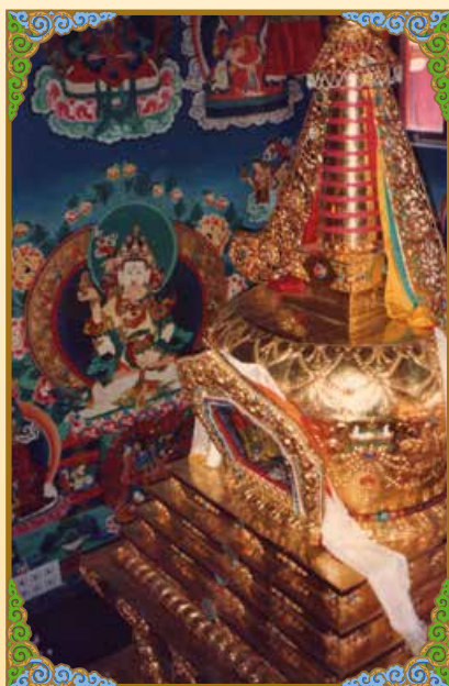
供奉敦珠法王二世法體之「舍利塔」 The Stupa in Which H.H. Dudjom Rinpoche's Kudung was Being Enshrined (1989)

廟內之「舍利塔」及所有壁畫全部均由夏札(威操)法王設計及統籌。 All the Wall Paintings and The Stupa Within the Temple were Designed and Coordinated by H.H. Chadral Sangye Dorje Rinpoche.