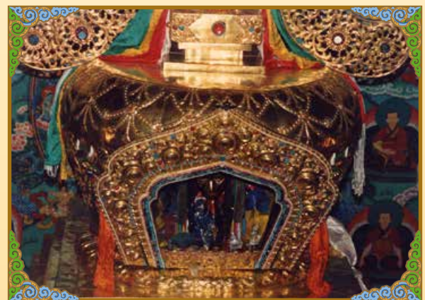
敦珠法王二世法體於「舍利塔」內之近鏡 A Close-Up of the Stupa in Which H.H. Dudjom Rinpoche's Kudung was Being Enshrined (1989)