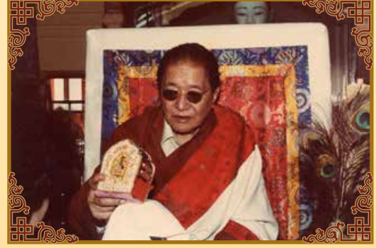
敦珠法王二世於灌頂法會時攝(1981) H.H. Dudjom Rinpoche was Giving Initiations (1981)