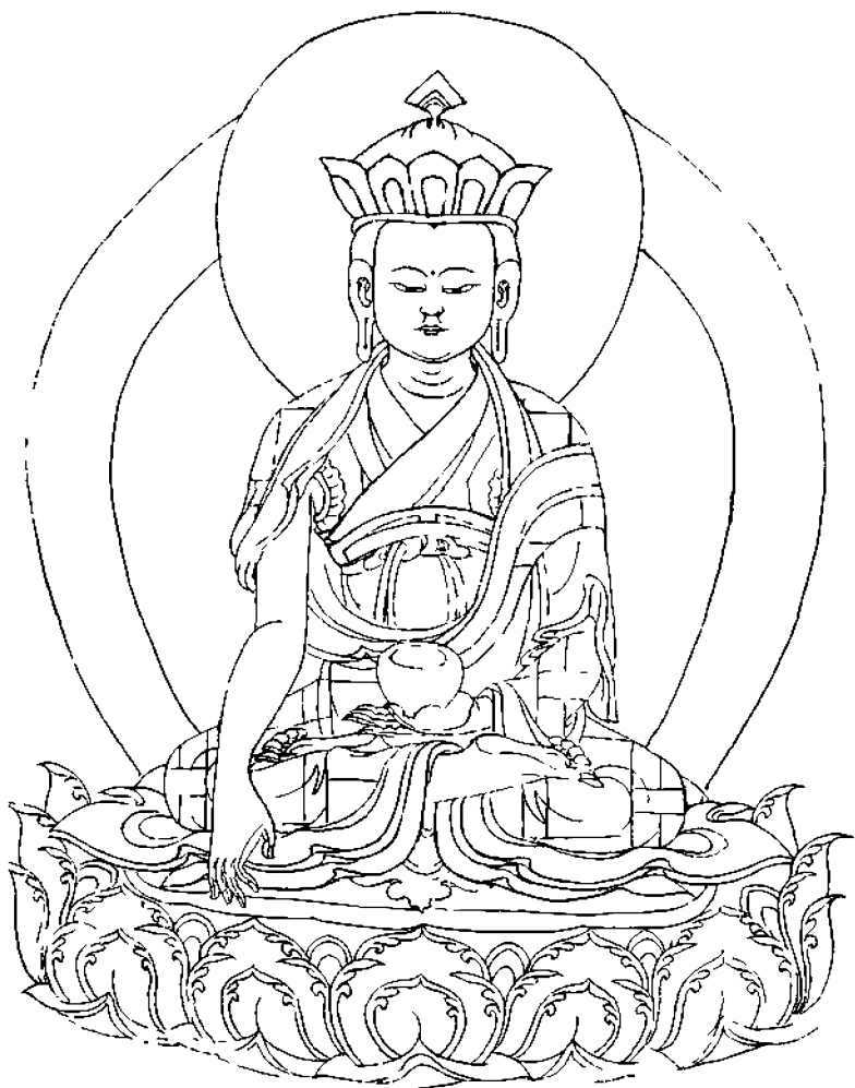
Tonpa Tritisug Gyalwa