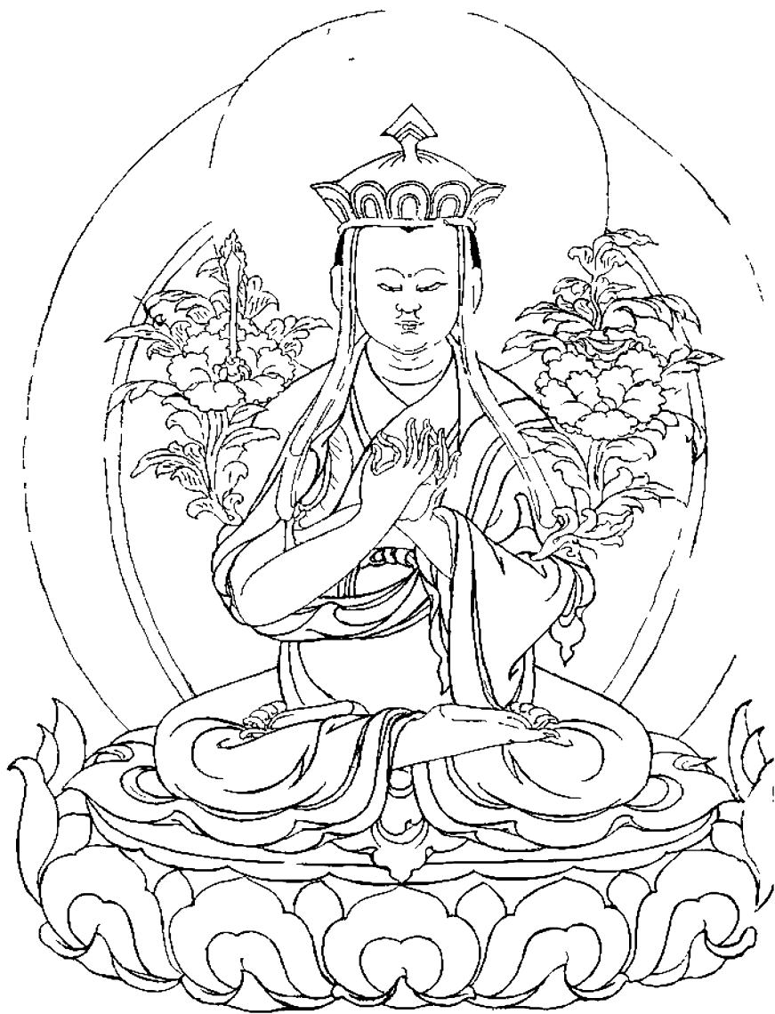
Nyame Sherab Gyaltzen