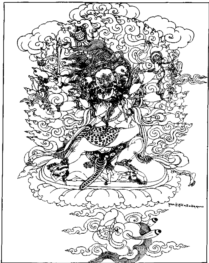
Tugkyi Trowo Tsocho Kagying