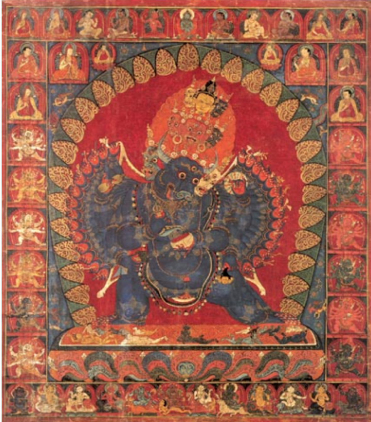
Figure 6: Vajrabhairava , Tibet, 14 th century, private collection