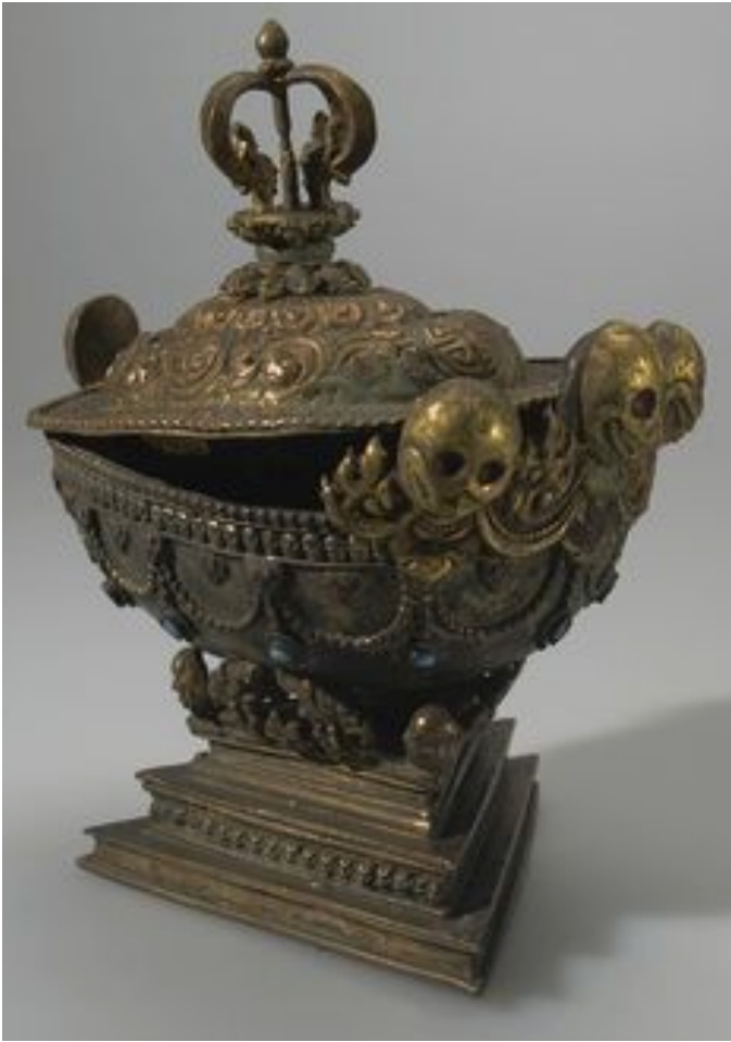
Figure 19: Bronze skull cup , Tibet/China, c.19 th century, American Museum of Natural History