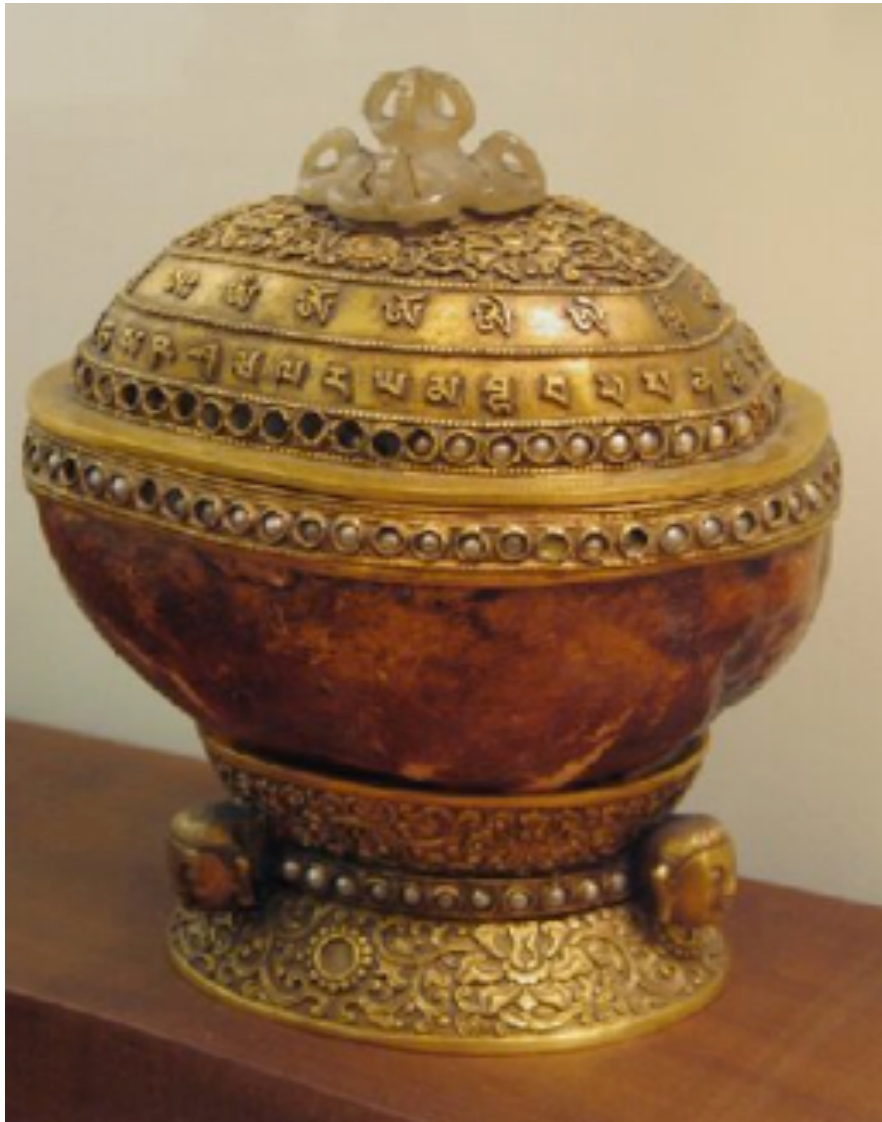
Figure 1: Kapāla , or skull cup, Tibet, 18 th century, Musee Guimet, France