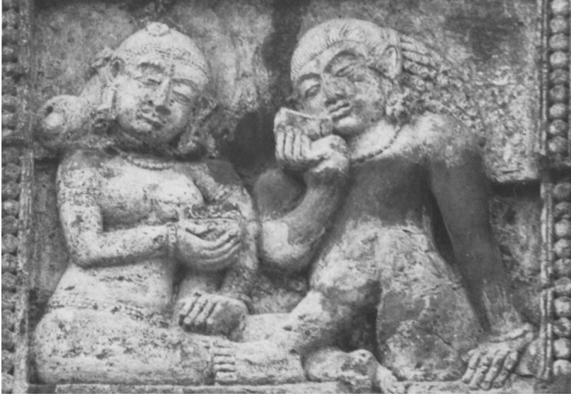
Figure 12: Couple eating from kapālas , Orissa (India), mid-9 th century, Madhukeshvara temple