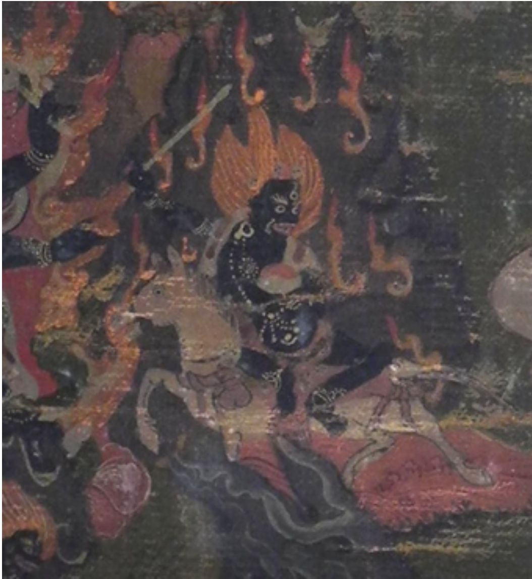
Figure 23: Yama and Yamantaka Rising from the Skull Cup of a Gelug Lama , Detail of Palden Lhamo with skull cup