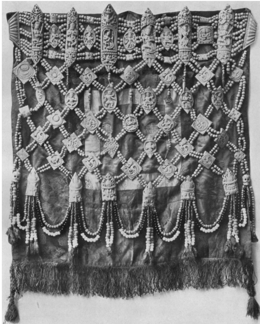
Figure 22: Bone apron , Tibet, date unknown (pre-20 th century), British Museum