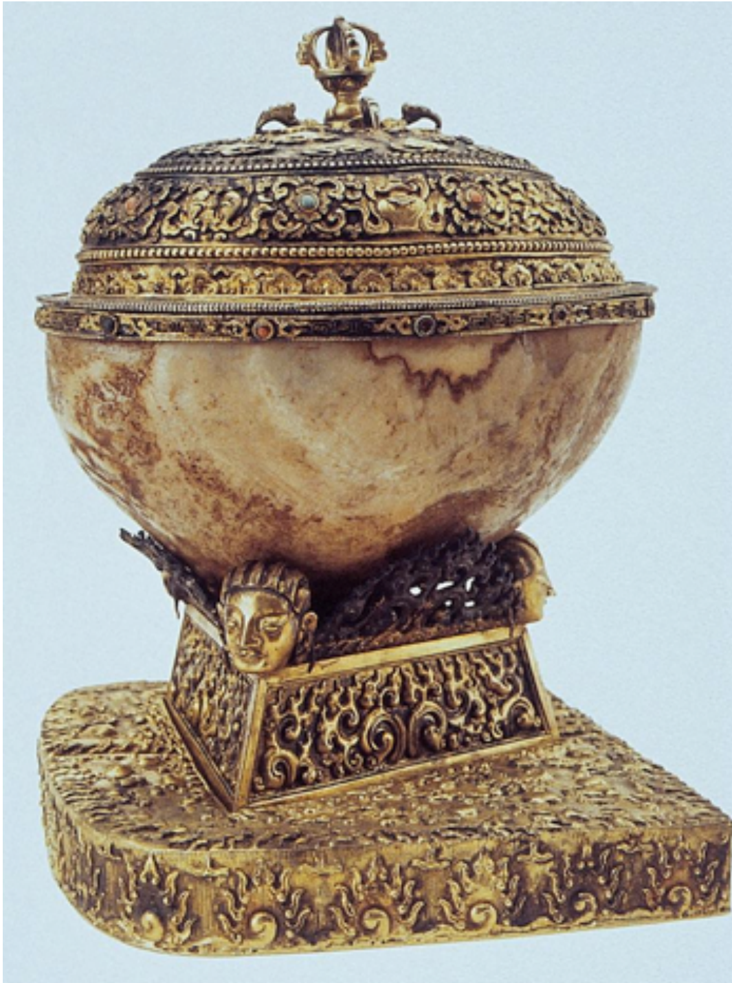
Figure 18: Kapāla , 18 th century, originally from the collection of the Qianlong Emperor (1711-1799)