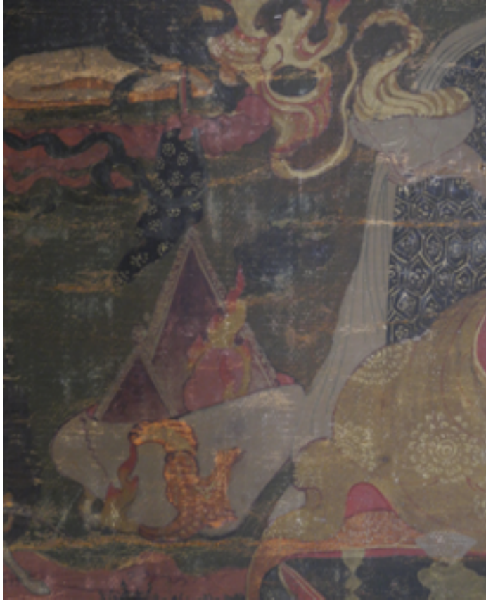
Figure 3: Yama and Yamantaka Rising from the Skull Cup of a Gelug Lama , Detail showing the large kapāla at center The skull cup in the monk's hand can be seen at top right.