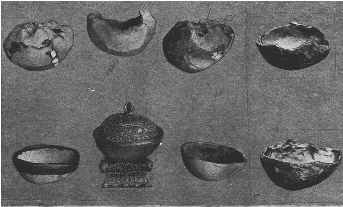
Figure 21: Drawing of skull cups , found in Balfour, “Life of an Aghori Fakir,” (1897)