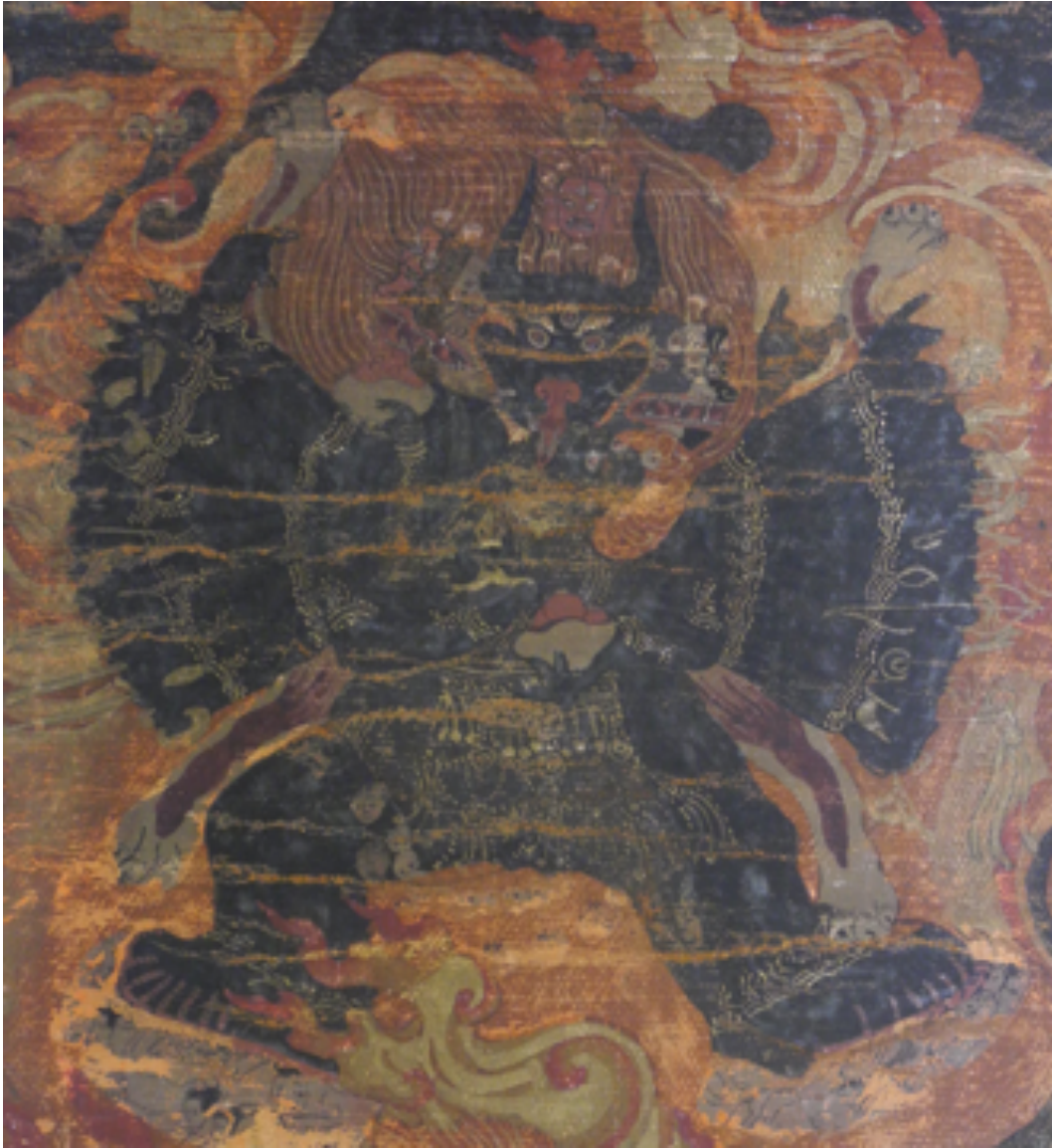
Figure 7: Yama and Yamantaka Rising from the Skull Cup of a Gelug Lama , Detail of Yamantaka Vajrabhairava with consort