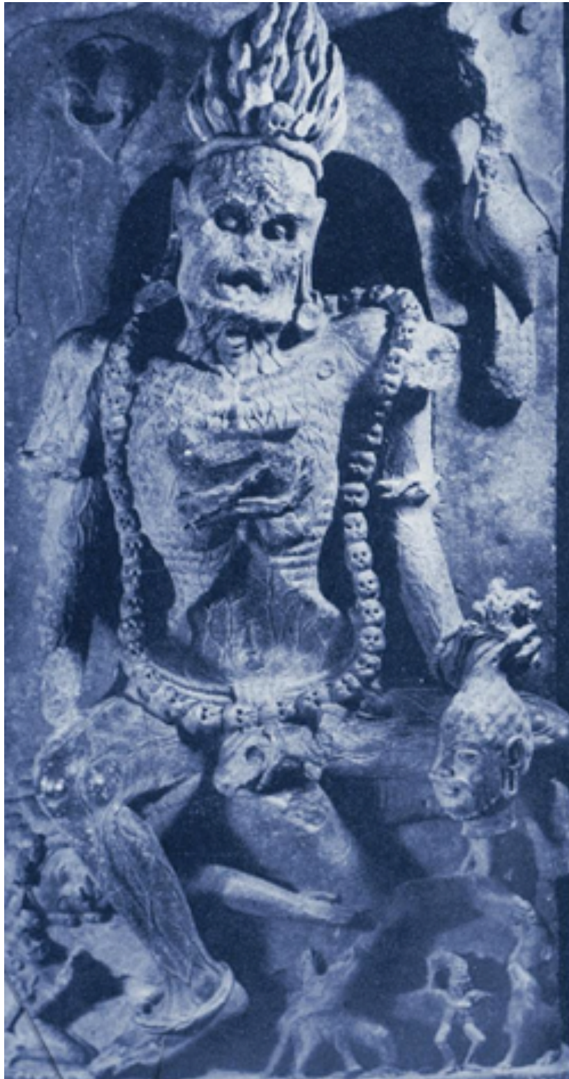
Figure 11: Kālī or 'Black earth mother', India, c. 8 th century