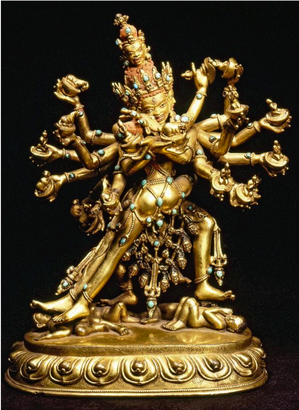
Figure 9: Hevajra , Tibet, 17 th century, Cleveland Museum of Art