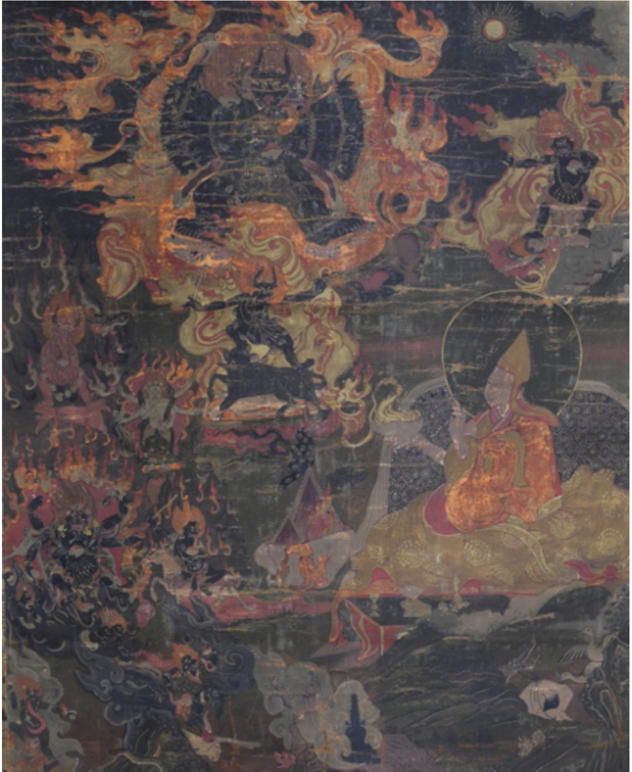
Figure 2: Yama and Yamantaka Rising from the Skull cup of a Gelug Lama , Tibet, 18 th century, Museum of Fine Arts, Boston