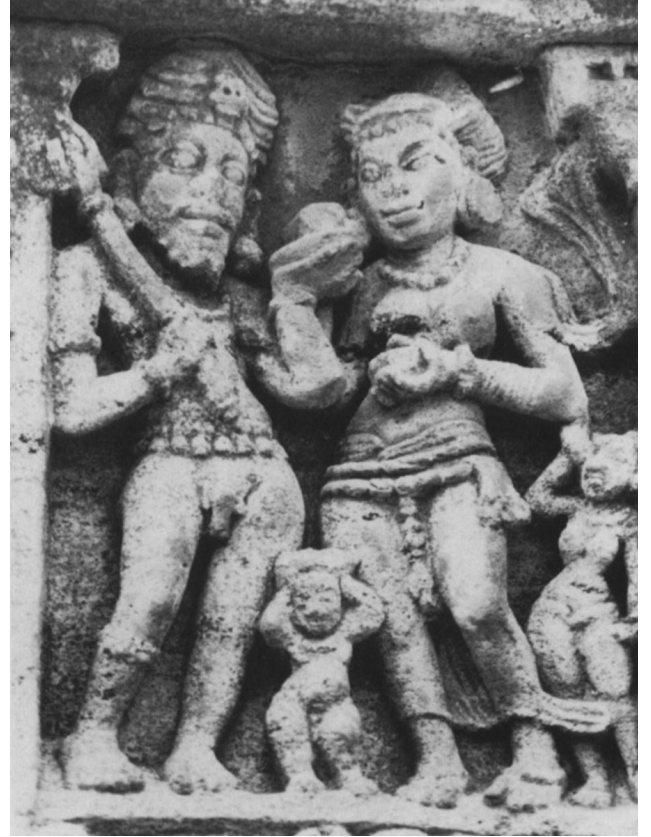
Figure 13: Kapālika ṛṣi as Bhikṣāṭana , Orissa (India), early 10 th century, Someśvara temple