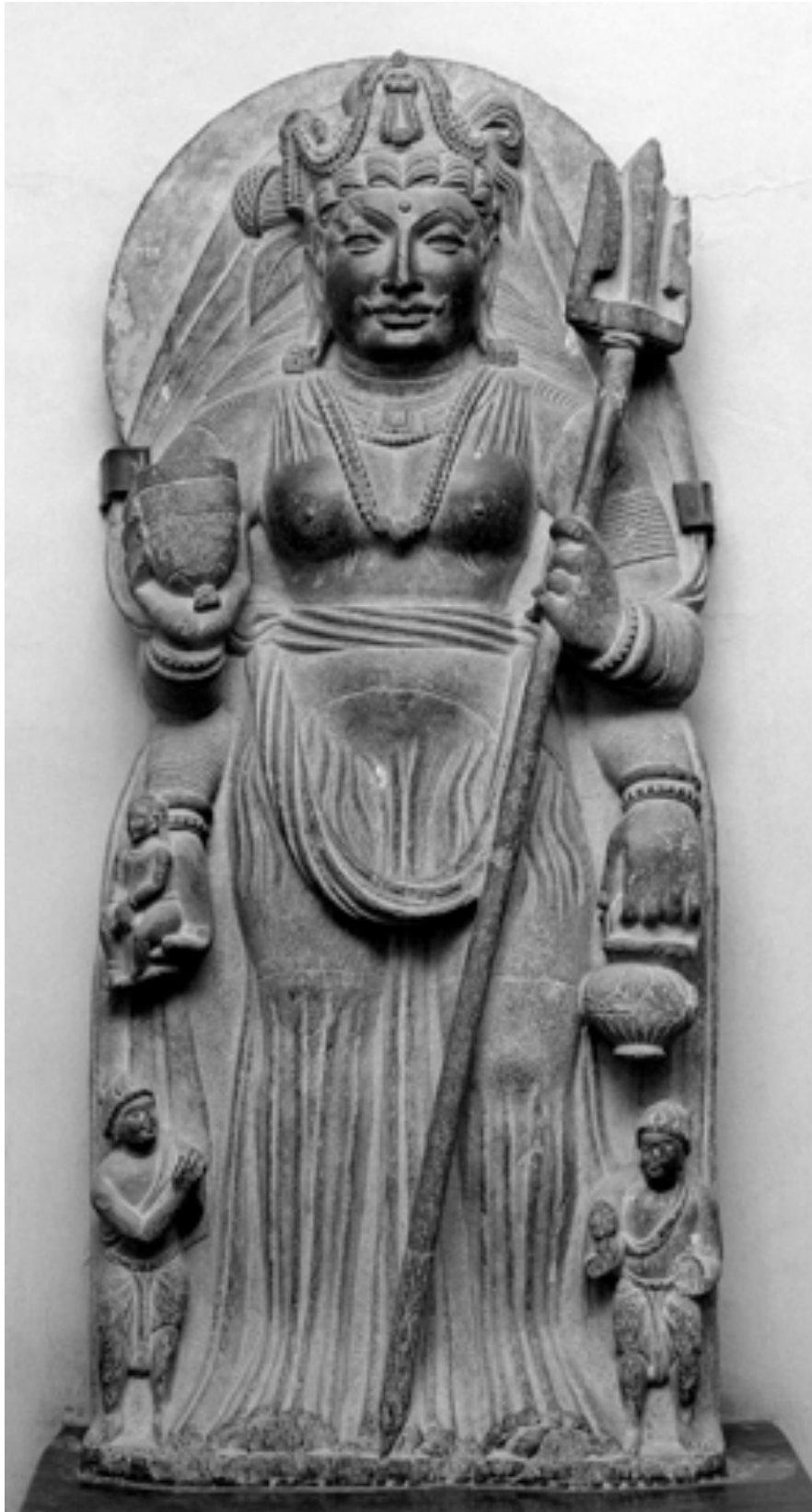
Figure 15: Hariti , Kusana (Pakistan), 1 st -3 rd century CE, Peshawar Museum