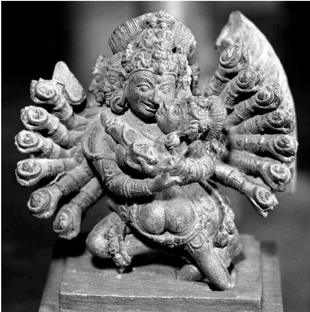
Figure 10: Hevajra , Pala (India), c. 12 th century, Indian Museum, Kolkata