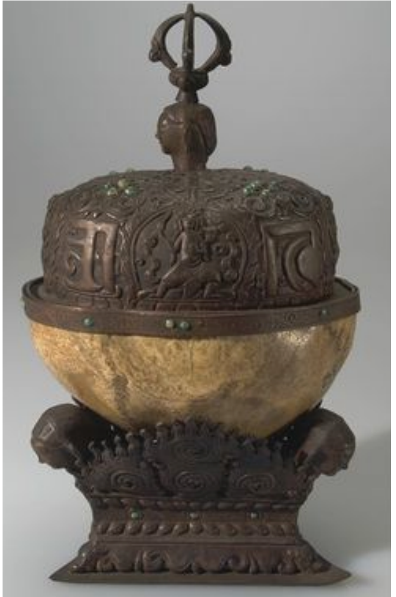
Figure 20: Kapāla , Tibet, c.19 th century, American Museum of Natural History