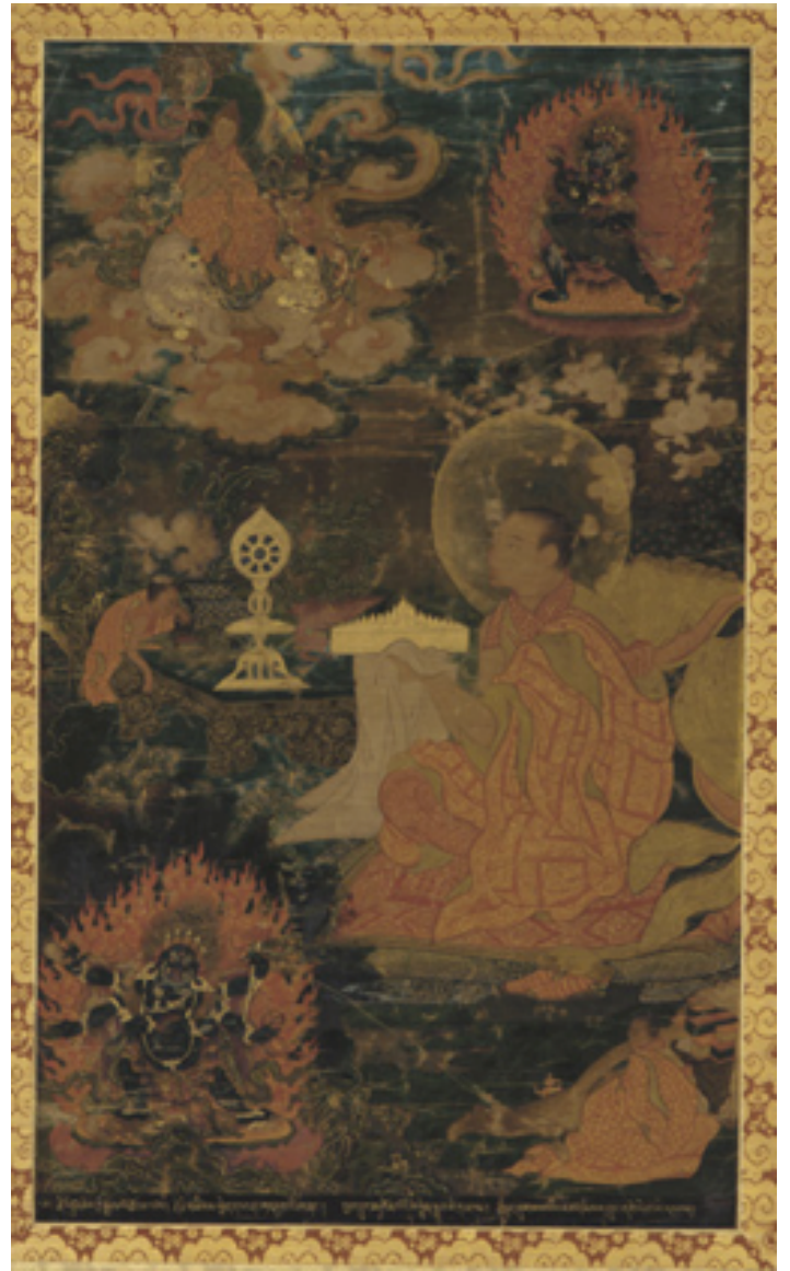
Figure 4: The Vision of Khas—grub—dje with Tsongkhapa appearing to him on an elephant , Tibet, 19 th century, Freer Gallery of Art, Washington, DC