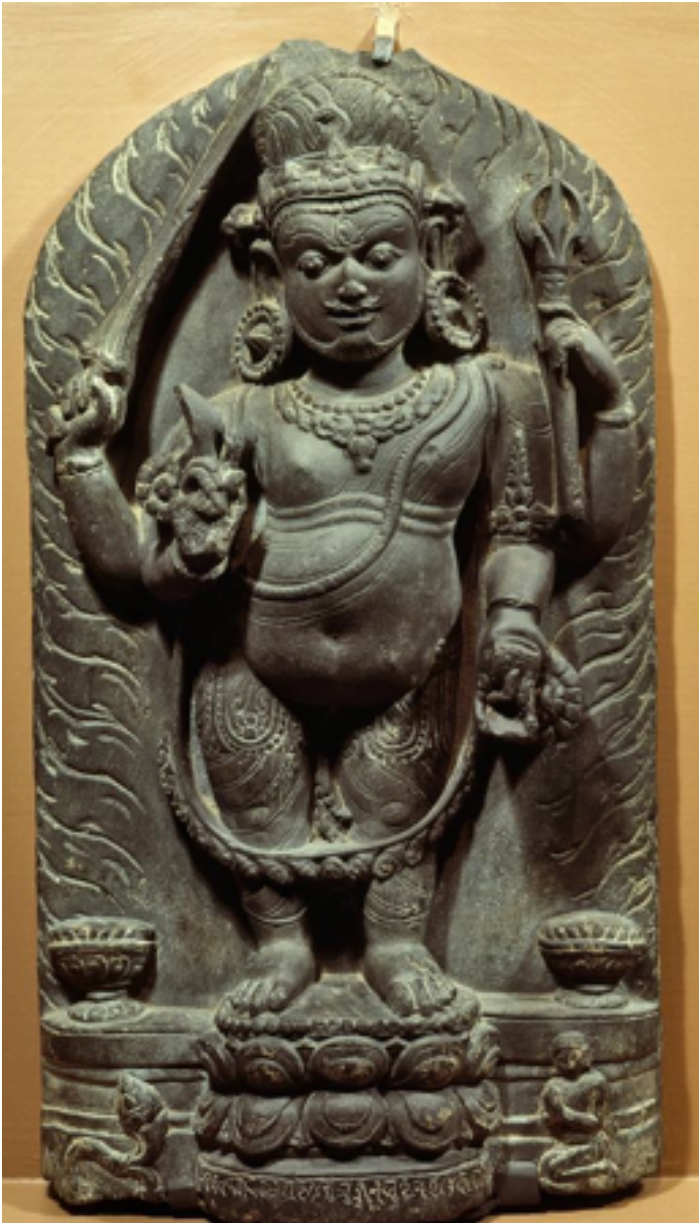
Figure 16: Bhairava , Pāla (India), 10 th century, Indian Museum in Kolkata