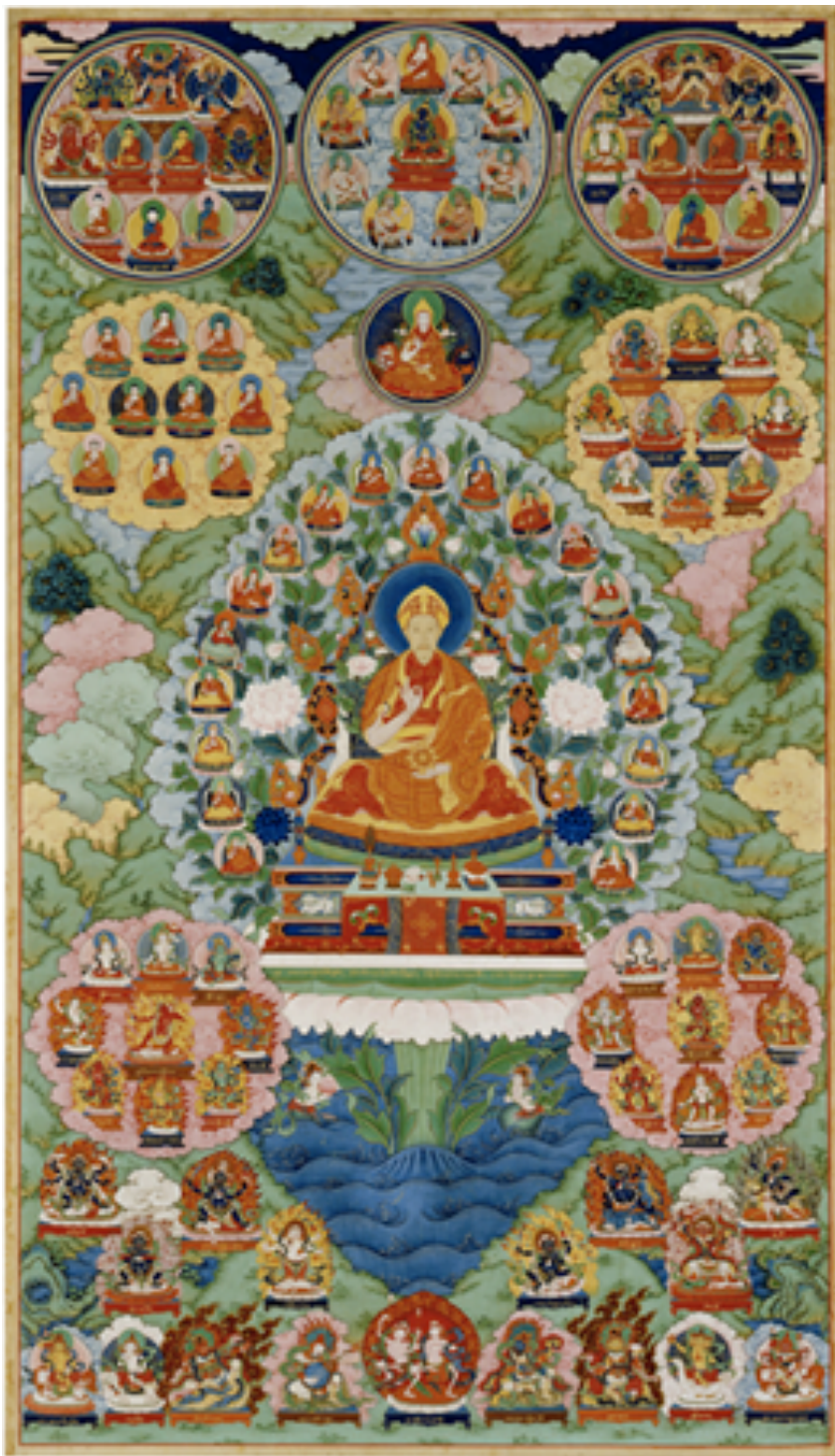
Figure 5: Portrait of the Qianlong Emperor as the Bodhisattva Manjusri , Qing (China), 18 th century, Freer Gallery of Art