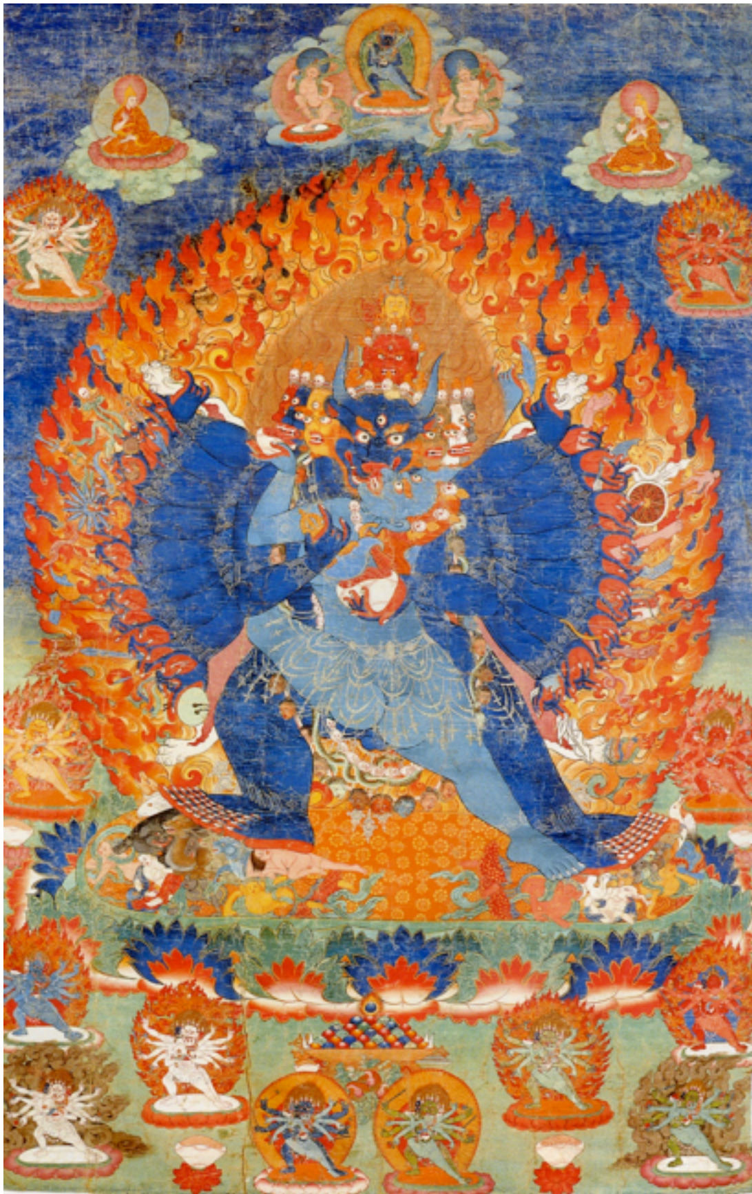
Figure 8: The Thirteen-Deity Yamantaka Father-Mother , Central Tibet, late 17 th -early 18 th century, Zimmerman Family Collection