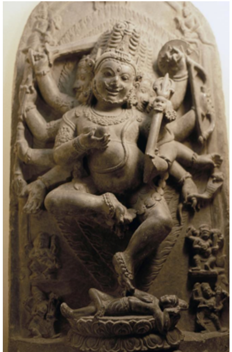
Figure 17: Mahakala , Pāla (India), 9 th century, Los Angeles County Museum of Art