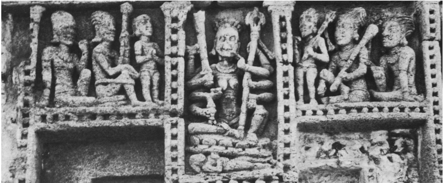
Figure 14: Cāmuṇḍā flanked by Kapālika ṛṣis , Orissa (India), early 10 th century, Someśvara temple