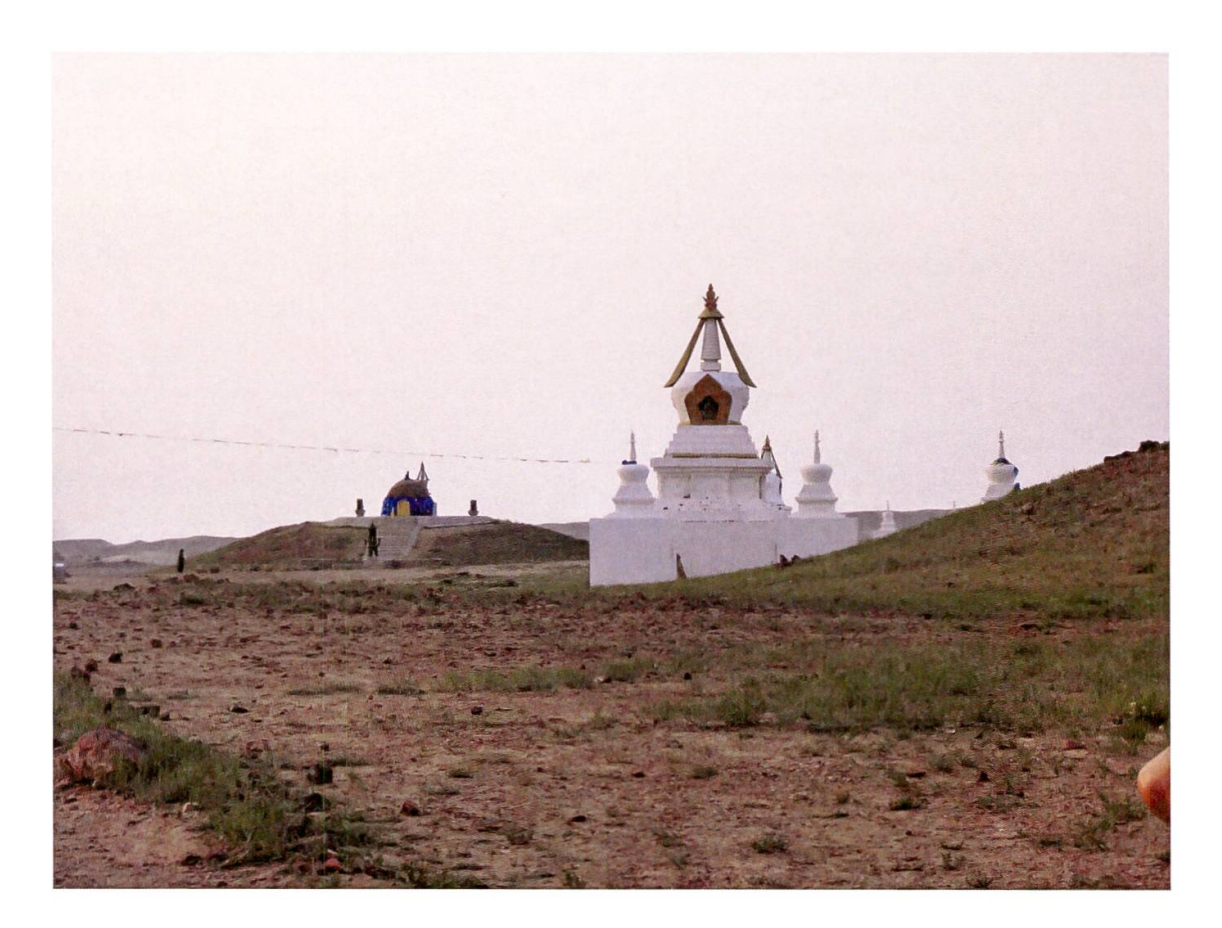
Figure 6: Tarkhi ovoo.

depression called "The stomach of the hungry ghost". At that spot, the pilgrims should burn previously prepared papers on which they have listed their nonauspicious deeds in this lifetime. A bit further in the square, they come to three small rock cairns building a diagonal line. The rocks point to Bayanzurkh Uul, the sacred mountain of the Third Noyon Khutagt. Here the pilgrims offer vodka. They will finally reach the most sacred part of the Shambhala Energy Centre, a small round hill on whose top is the Tarkhi Ovoo (Figure 6). The hill itself resembles a kapāla, a skull-cup used in tantric ritual, upon which an oboo is placed. The pilgrims circumambulate the oboo, all the while reciting wishprayers to be reborn in Shambhala after death.