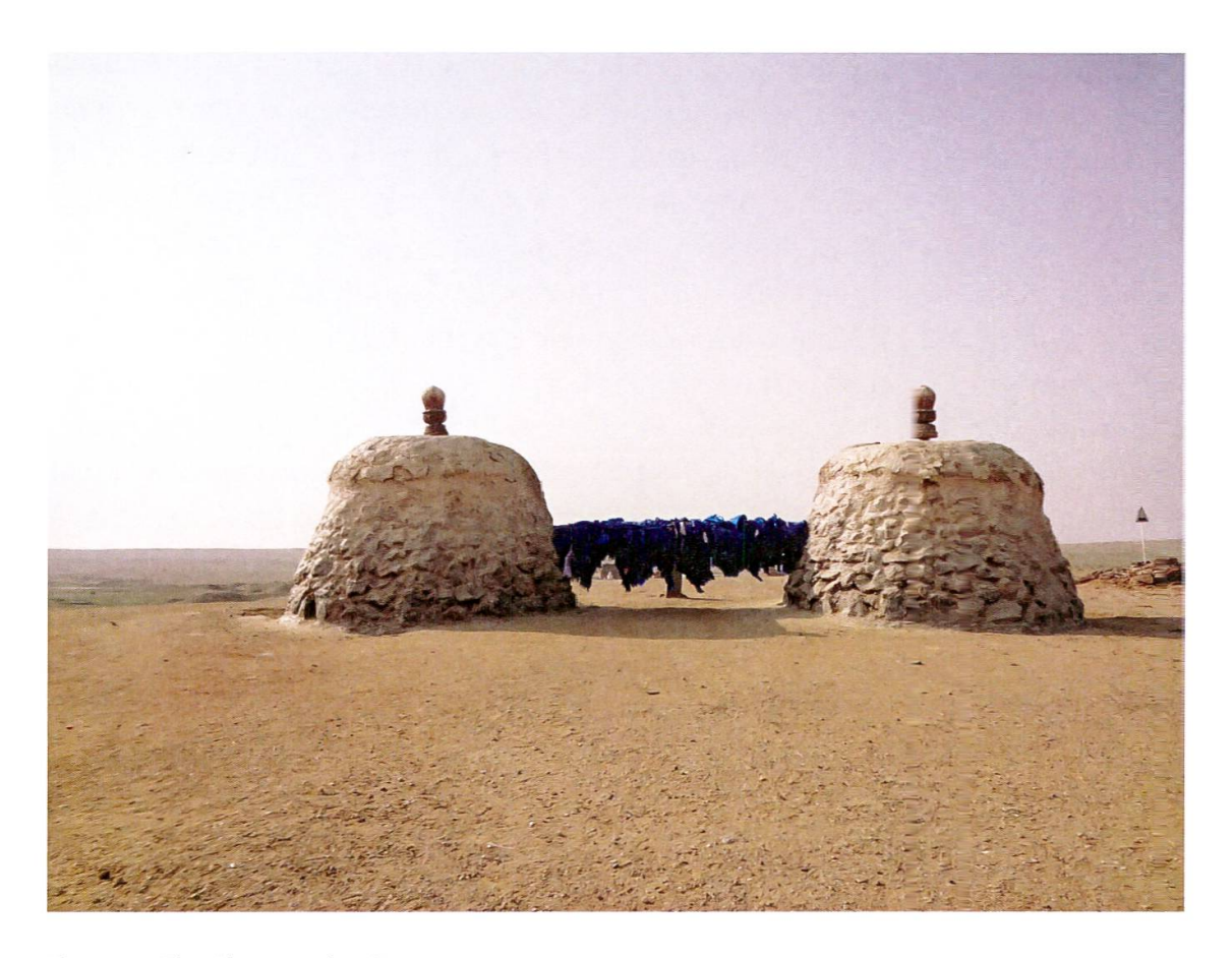
Figure 3: The "breast oboo".

Buddhism.<sup>75</sup> Not far from the temple complex, some two to three kilometres to the north-east, a site dedicated to the realm of Shambhala was built. The site in the form of a maṇḍala is surrounded by 108<sup>76</sup> stūpas (Figure 4). Danzan Ravjaa had a special affinity to the mythical realm of Shambhala that is closely connected to the Kālacakra tantra .<sup>77</sup> According to this tantra and other Tibetan sources<sup>78</sup> the mythical country of Shambhala lies somewhere north of the Himalayas and north of the mythical river Sītā. The country has the form of an eight-petalled lotus, which is surrounded by two ranges of snow-mountains. According to Tibetan and Mongolian Buddhist tradition, in Shambhala no evil is known, its people are naturally virtuous and good. Most of them obtain Buddhahood during their lifespan in Shambhala. Once somebody is born in this realm, he will never be reborn into a lower form of existence. This description shows close affinities to Buddhist concepts like the Buddha fields of