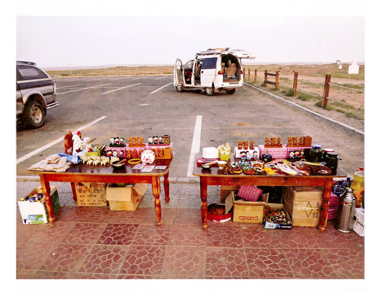
Figure 5: Souvenirs.

plastic wind horses (Mo. khii mori ), a couple of white stone elephants and other regalia considered to be particularly auspicious (Figure 5). At the ger camps, however, religious souvenirs are sold at a larger scale.