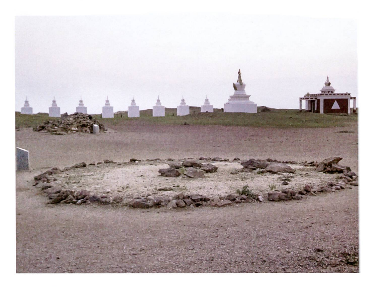
Figure 4: The Shambhala Energy Centre.

Sukhāvatī or Potala , but in one important aspect Shambhala differs from them. It includes an apocalyptic vision of a future battle between the last kalki of Shambhala, Raudracakrin, and the ruler of the infidels (Tib. kla klo , Mo. lalo ). One of the earliest Tibetan texts to deal with the kingdom of Shambhala, the sDom pa gsum gyi rab tu dbye ba of the Sa skya paṇḍita Kun dga' rgyal mtshan (1182–1251), describes the battle and its outcome thus: