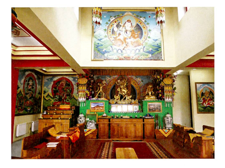
Figure 2: Inside the nun's temple.