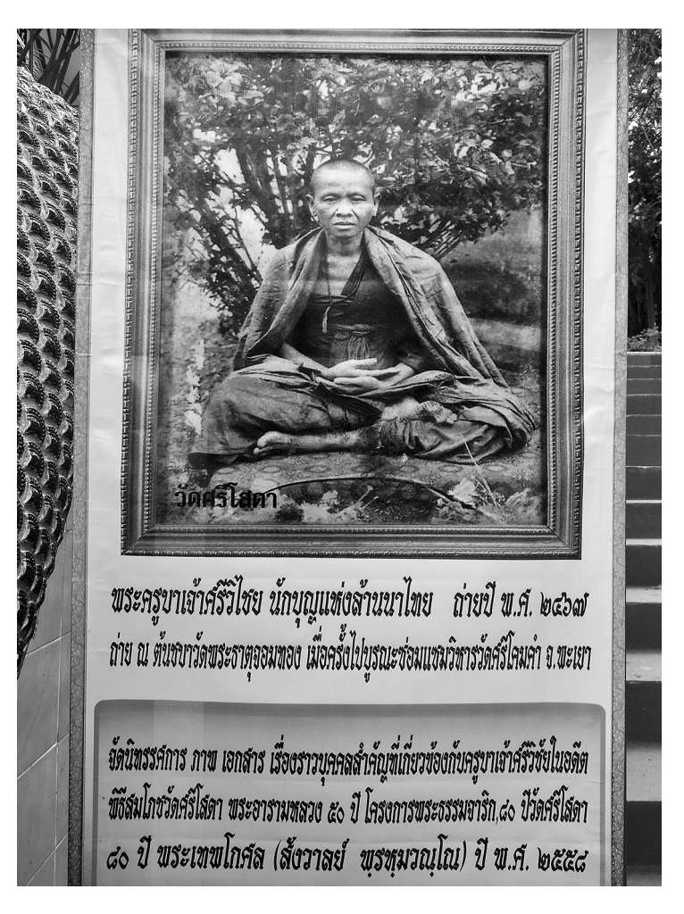
Appendix Photo 1 Khruba Siwichai, an Exhibition of Wat Si Soda 2015, Mueang, Chiang Mai, Thailand