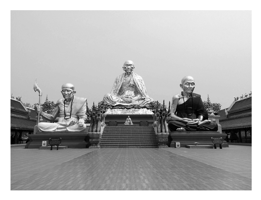
Appendix Photo 4 Statues of the Three Greatest Khruba of Lan Na: Siwichai, Khao Pi, and Wong at Wat Saengkaeo Phothiyan, Mae Suai, Chiang Rai, Thailand; Author's Image