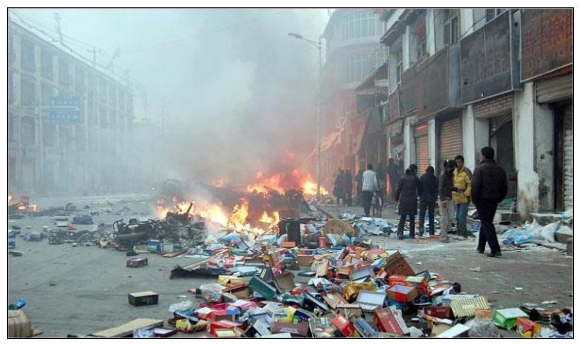
Figure 3. Disorder in the Barkhor, March 24, 2008.

Ethnic resistance last exploded in 2008. The anniversary of the March 10, 1959, national uprising converged with the Tibetan New Year, a frequent occasion of unrest. A group of monks marched on the Barkhor to protest the detention of colleagues from Drepung Monastery.<sup>11</sup> The PAP truncheoned them. Four days later, Tibetans responded by looting and burning Han shops and dwellings and setting fire to vehicles. Over two days, 19 ethnic Han were beaten and killed. According to Xinhua, 382 civilians and 241 police were injured ("Beijing's Blind Spot," p. A38). Dharamshala, the Tibetan government in exile, placed Tibetan deaths at 203, and thousands were detained (Barboza, 2008, p. A14; Wong, 2008, p. A6). The turmoil traveled quickly across the plateau.