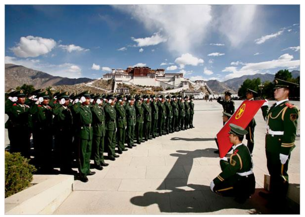
Figure 6. Youth Day in Potala Square, May 4, 2009.

use as window displays in hotels, restaurants and shops, decorating the vulgar landscape of this commodity-driven society controlled by ideology. Through such a process of being endlessly reproduced, [the palace] has been thrown down into the world of mortals from the heights of heaven."