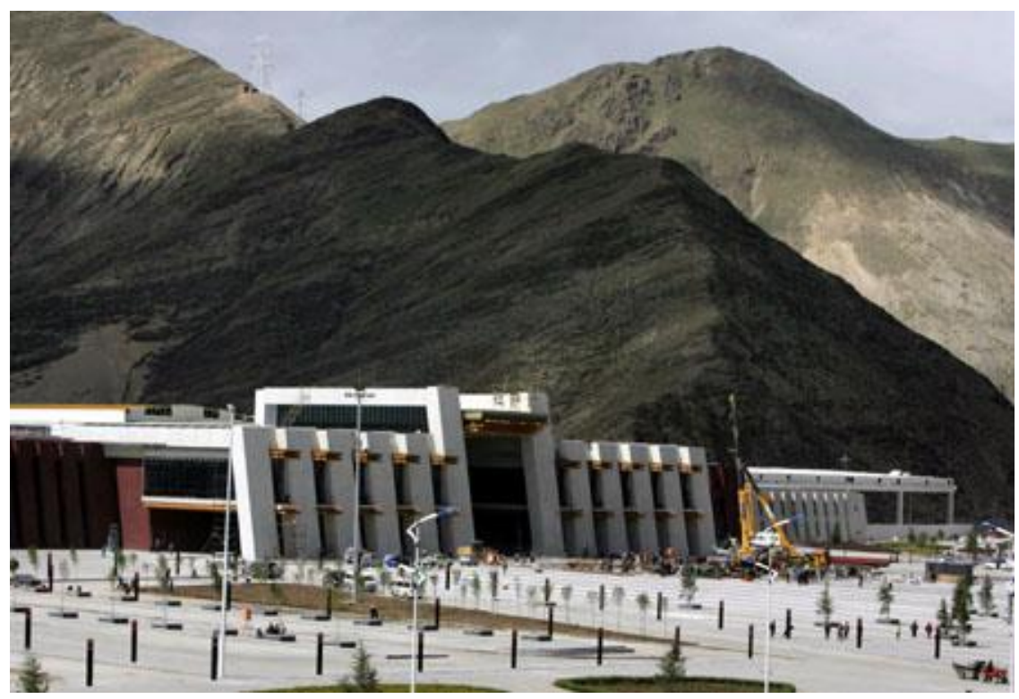
Figure 7. Lhasa Railway Station.

International Journal of Communication 7 (2013)