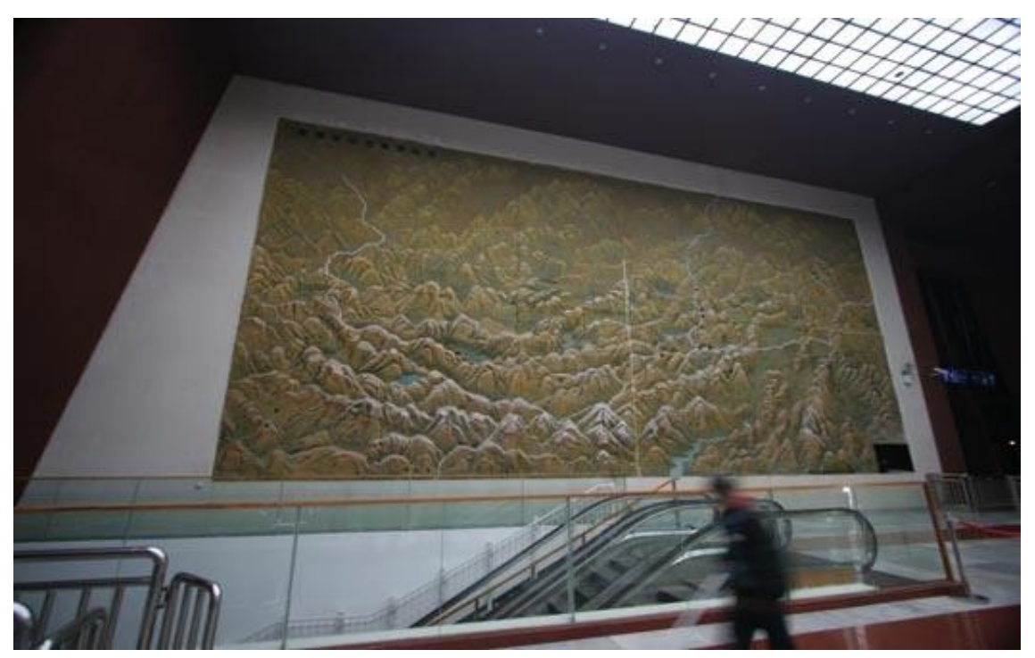
Figure 8. Topographic map inside the Lhasa railway station.

The production of "solidification" continues within. A bronze, wall-sized topographic map of the TAR naturalizes the military-bureaucratic conquest of modern Tibet (Figure 8). A larger tapestry of the Potala hangs in an immense VIP waiting room nearby. (An even larger Chinese carpet covers the floor.) The eight auspicious Tibetan symbols carved in relief on the ochre walls of the waiting rooms have been sinicized in submission to the dominant culture.