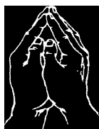
Buddha Shrine Mudra

First homage to the Root Guru and all Buddhas in all times and directions (Using Buddha Shrine Mudra)