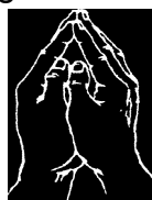
Buddha Shrine Mudra

First homage to the Root Guru and all Buddhas in all times and directions ( Using Buddha Shrine Mudra)