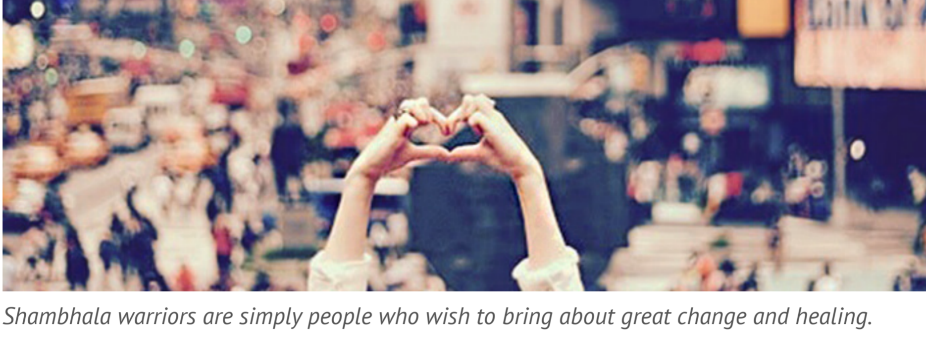
Shambhala warriors are simply people who wish to bring about great change and healing.

Shambhala warriors have no uniform, no insignia, they may not even recognise each other on the street. It is an individual path. But these people of spirit are called upon to go into the corridors of power and to dismantle the weapons of mass destruction. From within, the Shambhala warriors bring about great change and healing. They can do this without fear, says Choegyal, because they know that these weapons are made of the mind and, therefore, can also be dismantled by the mind. The Shambhala warriors know that the forces of destruction do not come from outside ourselves but from within; that it is our own greed and fear and hate that creates the weapons that now threaten the world.