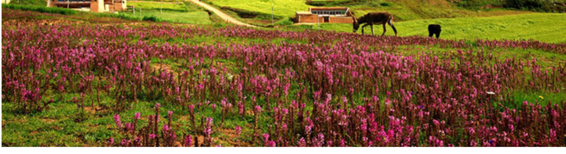
There have been many expeditions to find the mysterious kingdom of Shambhala.

Chogyam Trungpa, a Buddhist monk who fled Tibet during the Chinese invasion, received the forgotten teachings of Shambhala as a "Terma" (hidden sacred treasure), as he meditated in a cave attempting to wait out the invasion. He quickly transcribed the insights and teachings he received, but unfortunately, as he crossed a river being shot at during an attack by the Chinese army, these original teachings were lost. However, some years later, the Terma was again recovered and he went on to bring the teachings of Shambhala wisdom to the West. He established the USA's first Buddhist-inspired university, many meditation centres around the world, and specialist centres in Shambhala warrior training. He is the author of a number of books on Shambhala including Shambhala: The Sacred Path of the Warrior and Cutting Through Spiritual Materialism and is the father of Shambhala teachings in the West today.