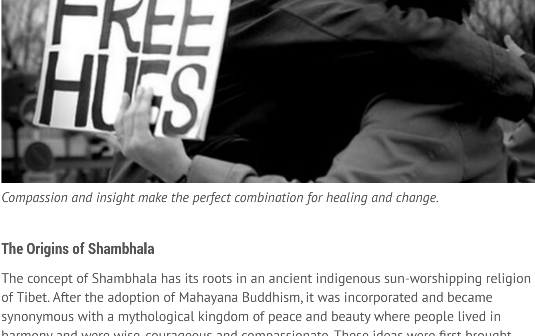
Compassion and insight make the perfect combination for healing and change.

Insight brings with it the knowledge that every action, undertaken with pure intent, creates a ripple of healing in the world that has repercussions far greater than we can imagine. Alone insight can be too cool and detached, so it needs the heat and power of compassion to move it into action. The two combined create wise actions that can transform and heal the whole planet, especially if large numbers of warriors – an army in fact – are working on it together.