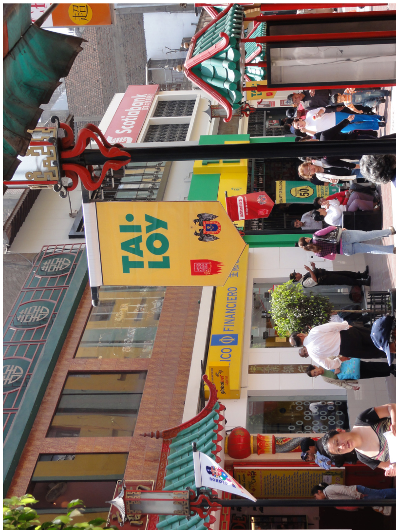
Figure 3: Another view of Capon Street.