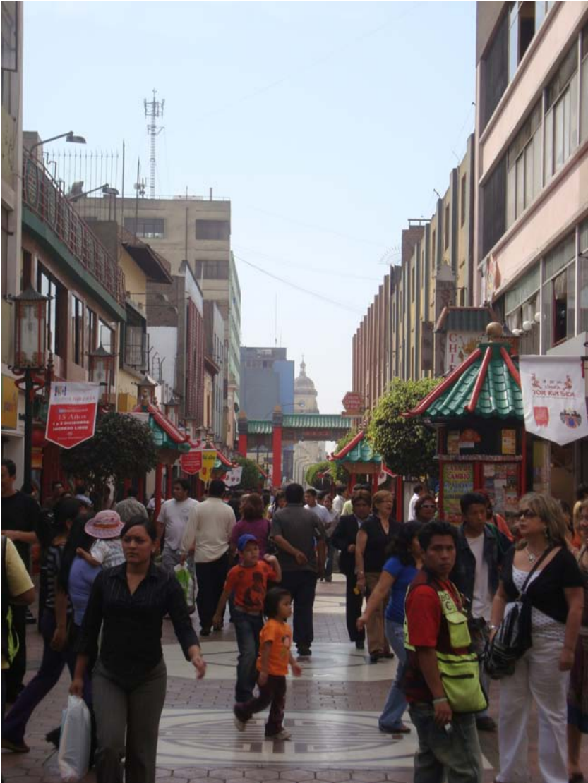
Figure 2: Capon Street (courtesy of I. Lausent-Herrera).