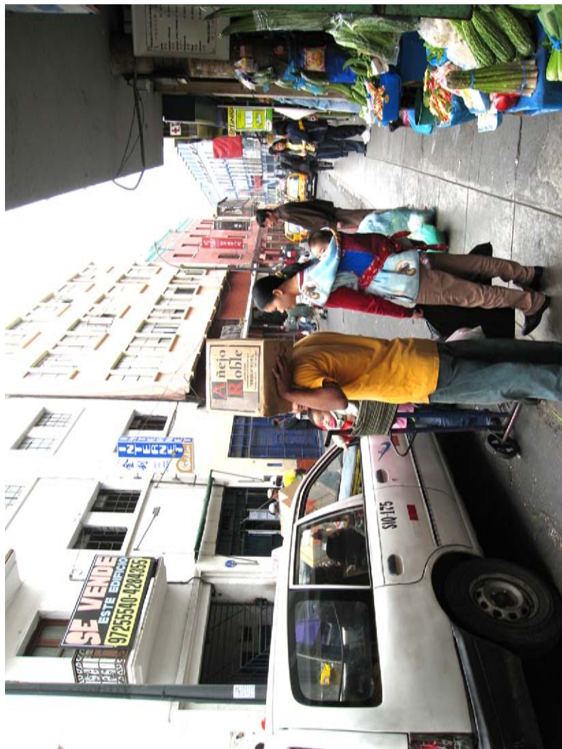
Figure 4: New immigrants in Paruro Street.