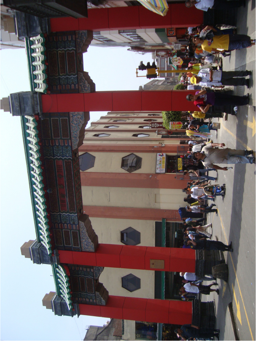
Figure 1: Chinatown Archway (Courtesy of I. Lausent-Herrera).