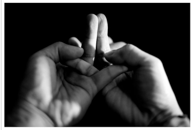
Mandala hand gesture

liberating anything that it touches. The sequence of the practice is very intense, and begins with the practitioner recalling everything that he or she has done wrong since beginning less time. They then repent for their mistakes, and ask for absolution from the deity, Vajrasattva.