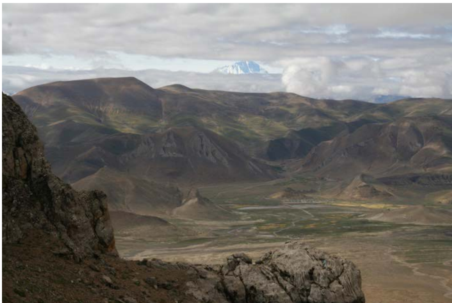
Fig. 1 — Ding ri seen from rTsi ri mountain.

provides the background from which these teachings emerged, detailing the lineages and textual transmissions received by Yang dgon pa. It shows how he was trained in all the main practice traditions of his time, out of which he modeled his unique approach.