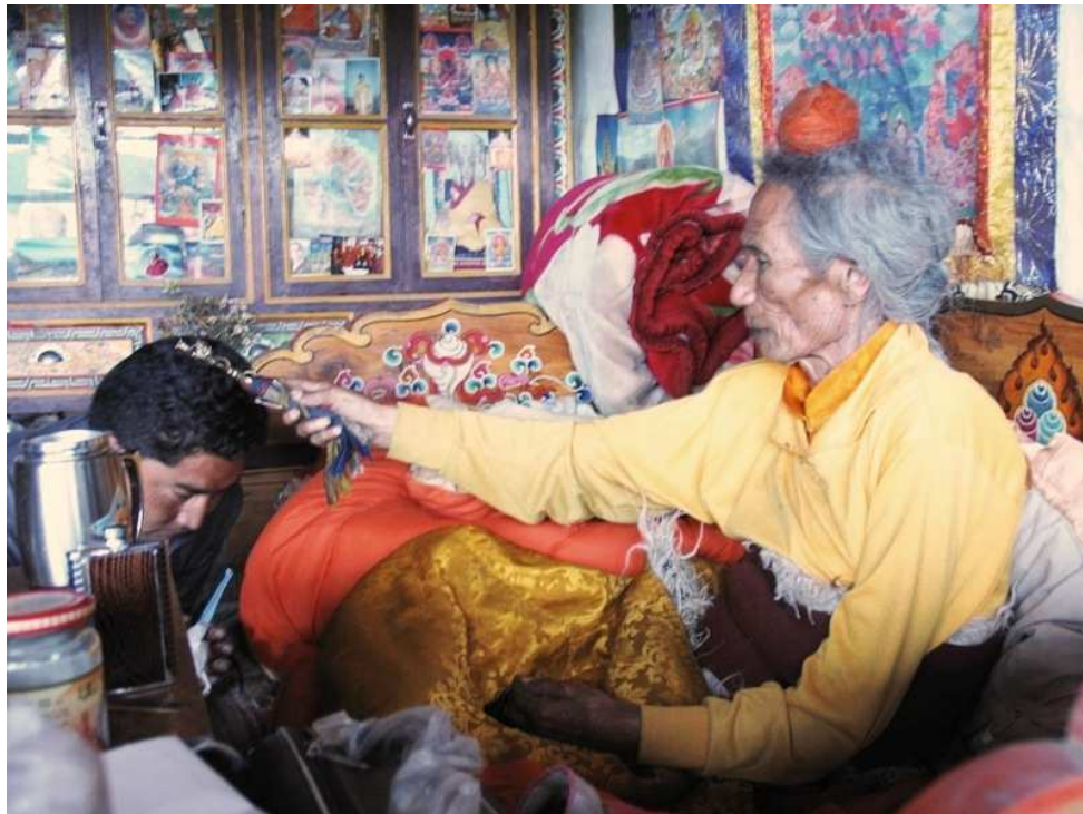
Figure 2: bDe chen 'od gsal rdo rje offering a blessing with one of his Treasure items, a Hayagrīva ritual dagger ( rta mgrin phur pa ) in his residence at rDza mer chen nunnery.