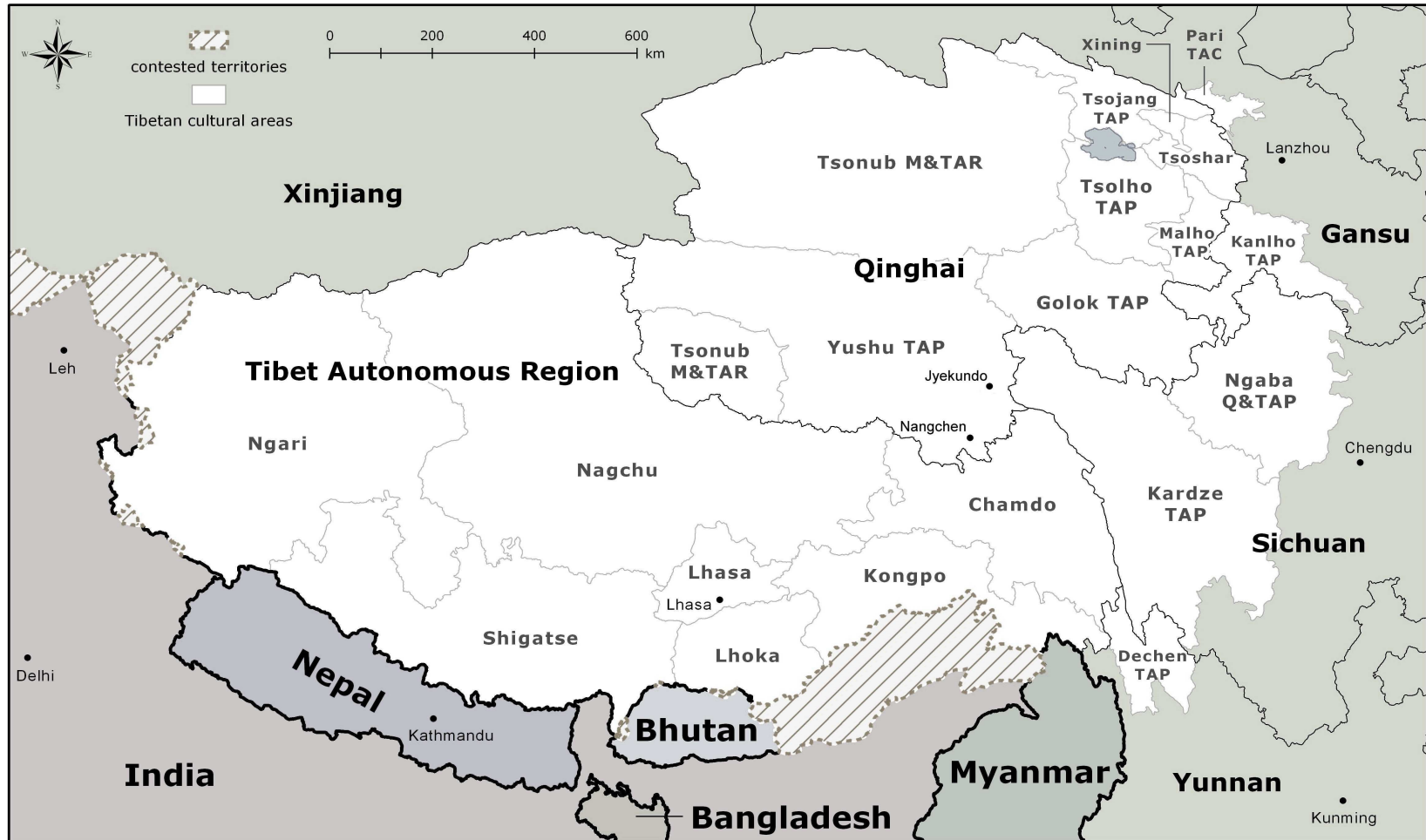
Map of Tibet